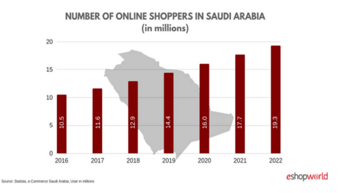
Figure 1: Number of online shoppers in K.S.A. (in millions)

In spite of having extraordinary online savviness, Saudi Arabian e-commerce sector is developing slowly. With an intake per capita of $8,329 plus the second leading mobile broadband saturation in the world, Saudi Arabia has merely 1.4 percent of e- retail concentration. Smartphones have a tendency to be utilized for social media, where the mediocre Saudi passes 7 hours per day (Garrós, 2019).