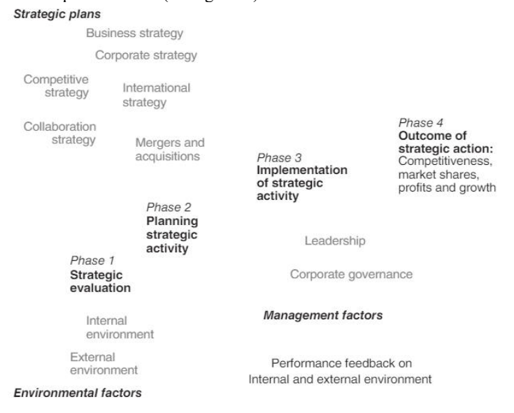
Fig 1: Components of strategic management

Outcome of the strategic action after executing and evaluating the process, management should look at the outcome if it meets the expected results (Zhang 2009).