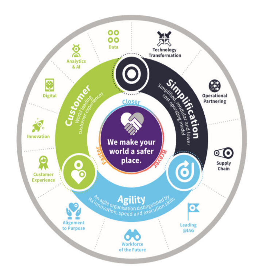
Figure 4: IAG Strategy

IAG strategy is based on the three major aspects as follows (Refer Figure 4: IAG Strategy): (1) customer - data analytics and digital innovation to enhance customer experience, (2) simplification – supply chain partnering for low-cost operational model, and (3) agility - agile organisation developing skilled future workforce.