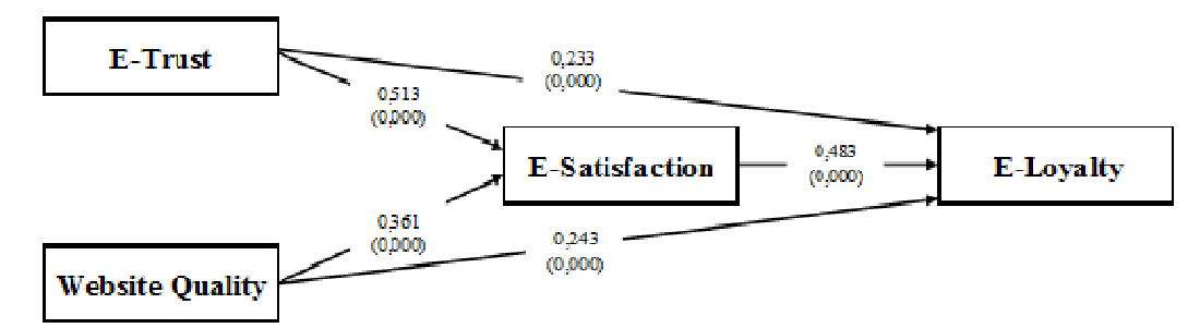
Figure 3.2 Analysis Results

Keterangan: X1 = E-Trust, X2 = Website Quality, Z = E-Satisfaction, Y = E-Loyalty Source: Data processed by the researcher, 2019