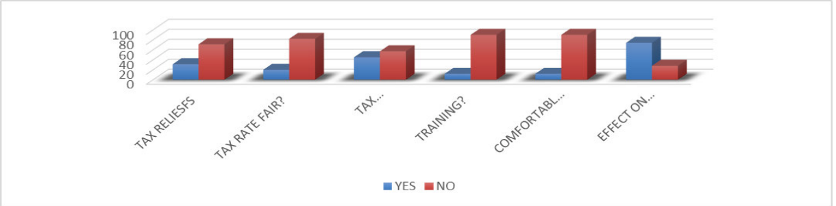
Figure 4.2 Response Chart

With regards to the issue of Tax reliefs (incentives) to SMEs, about 69.6% reported to avail no such benefits. This raises an important question on the effectiveness of Tax systems as majority of the surveyed SMEs with less than 10 years of age and during the initial growth period; often the organizations require support in terms of such incentives. Regarding training by the tax authority for the business owners, 88.2% of the respondents received no such training. With the limited knowledge about the core tax system and it legalities, only 44.1% of the respondents employ the services of tax practitionists.