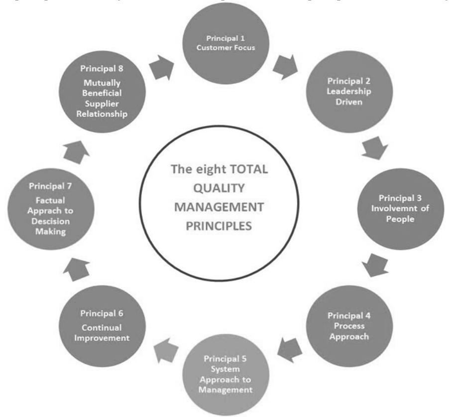
Figure 1. Principles of TQM practices (source: Northlink College, 2015)