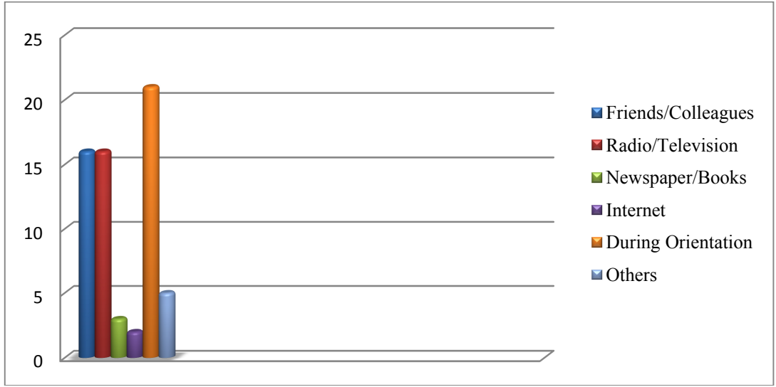
Figure 1: Distribution of TISHIP policy holders by sources of information