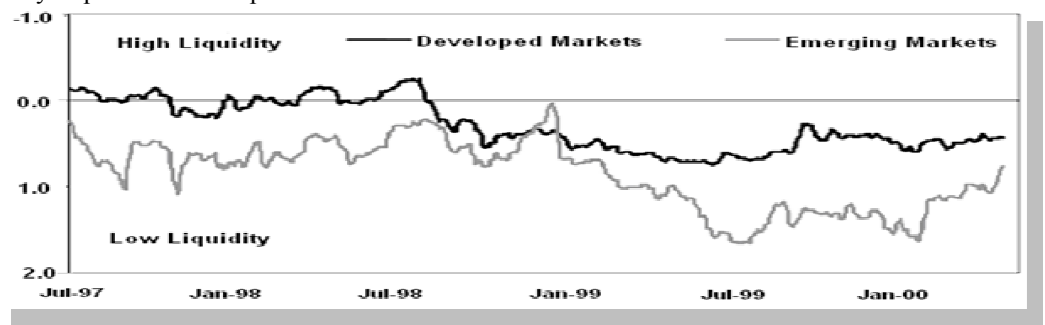
Figure 3. Liquidity Index for Emerging and Developed Markets between 1997 and 2000

Ahimud et al. (1997), Henry (2000a; b) contest that increased stock market liquidity can also reduce the cost of equity capital via a reduction in the expected return that investors require when investing in equity to compensate them for associated risks i.e. risk premium. Figure. 3 shows the liquidity levels in both developed and emerging markets for cross-border investors for the period 1997-2000. In this period emerging market liquidity started to decline after the South Korean "devolution" in November 1997. The crisis in Korea appears to have had a more systematic impact on flows and liquidity than the previous devaluations in Thailand, Indonesia and Malaysia. Liquidity conditions in developed markets began to downturn just prior to the Russian crisis of August 1998. Essentially, the argument is that since 2000, concerns seem to have concentrated upon emerging markets, with few liquidity impacts on developed markets.