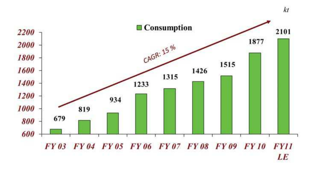
Figure 1 Indian Aluminium Market Growth