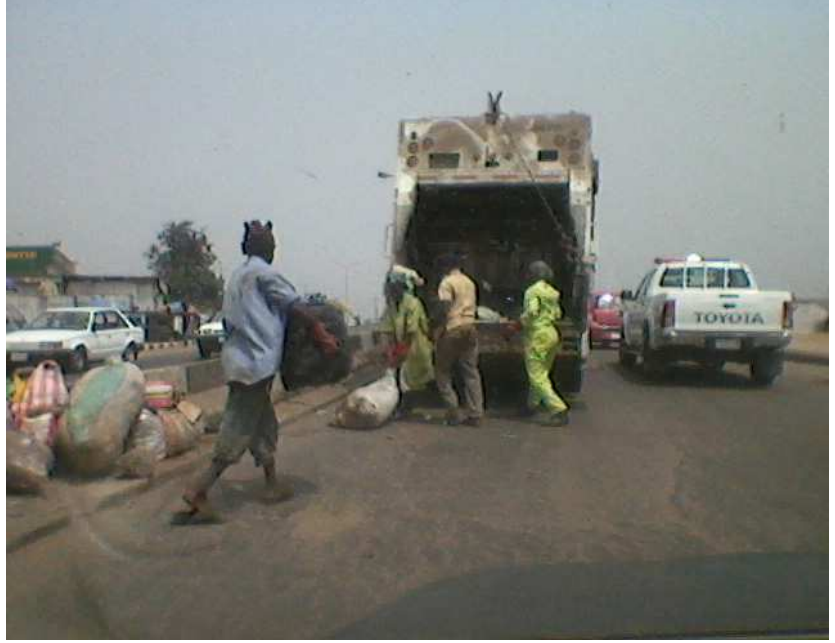
Fig 5. Showing the government lorry that comes to remove the dirt.

The above response also reveals that government is making frantic efforts to curb environmental pollution through the provision of waste containers and lorries as well as empowering youth through the YOUTH Empowerment Scheme of Oyo state popularly referred to as "YES" O. Fig 5 below shows the government lorries that comes to remove the refuse