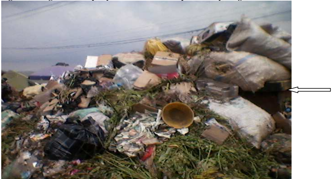
Fig 4. Showings the inadequacy of waste containers provided by the government.

Hence while respondents perceive that they are keeping their immediate environment clean, it still does not prevent environmental pollution as attempts to prevents their immediate environment from getting polluted invariably increase the pollution of the larger market and its surrounding environs as measures put in place to ensure proper waste disposal are inadequate. Fig 3. Above shows waste dumped on the road side some distance from the market. The pollution in the market is therefore due to "illegal" disposal of wastes which is probably being due to lack of adequate waste containers in the market as shown in fig 4. The arrow shows the waste container that is almost covered up with refuse.