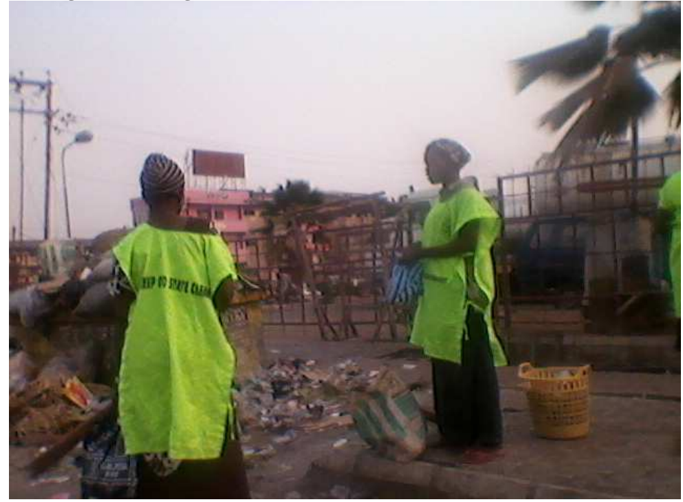
Fig 6: Showing government cleaners grumbling over a dirty surrounding around a waste container in the morning while cleaning

and untidy both throughout the night and during morning hours until the cleaners who have been recruited by the government come around to do the cleaning. Thus, making the cycle of environmental pollution to continue. Fig 6. shows government cleaners complaining over a dirty surrounding around a waste container while cleaning in the early hours of the morning.