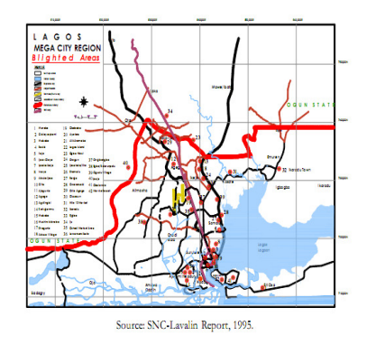
Fig 3Legend: See legend below

Fig 1 showing map of Lagos state Fig 2 showing location of Ajegunle slum settlement (highlighted portion) Fig 3 showing location of other informal settlements in Lagos