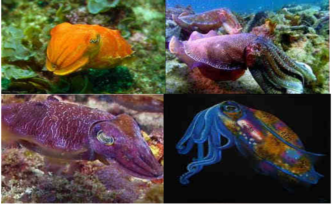
Fig 1. Different colours of Cuttlefish