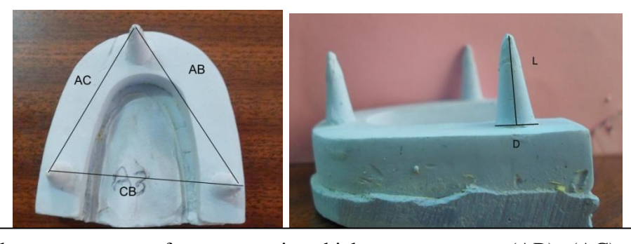
Figure 2: The tested measurements of stone cast in which measurements (AB), (AC), and (CB) represents the distance between the tips of the cons and (L) represent the length of the cone and (D) represent the measurement of the base of the cone.