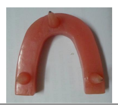
Fig 1: Master model