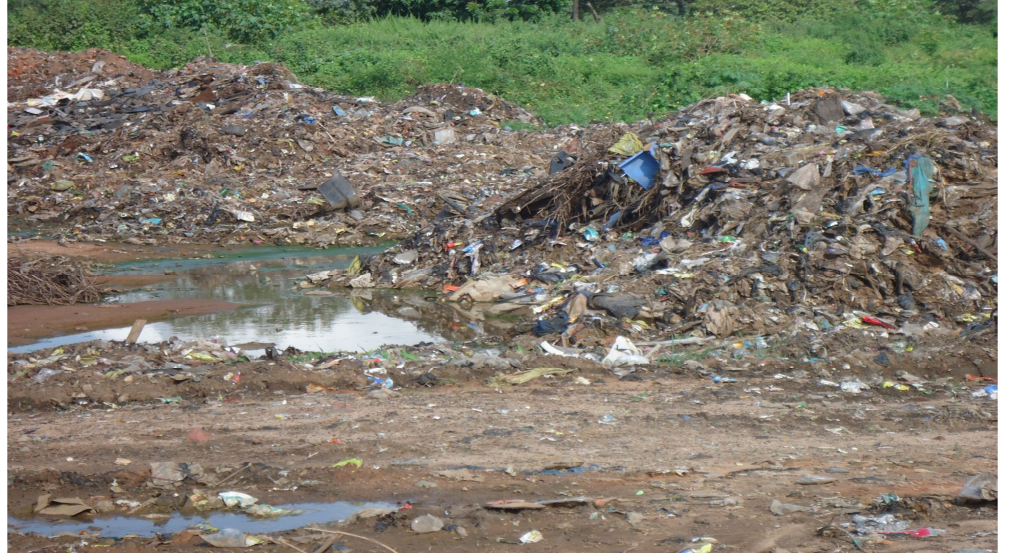
Fig. 4 Jos road dumpsite