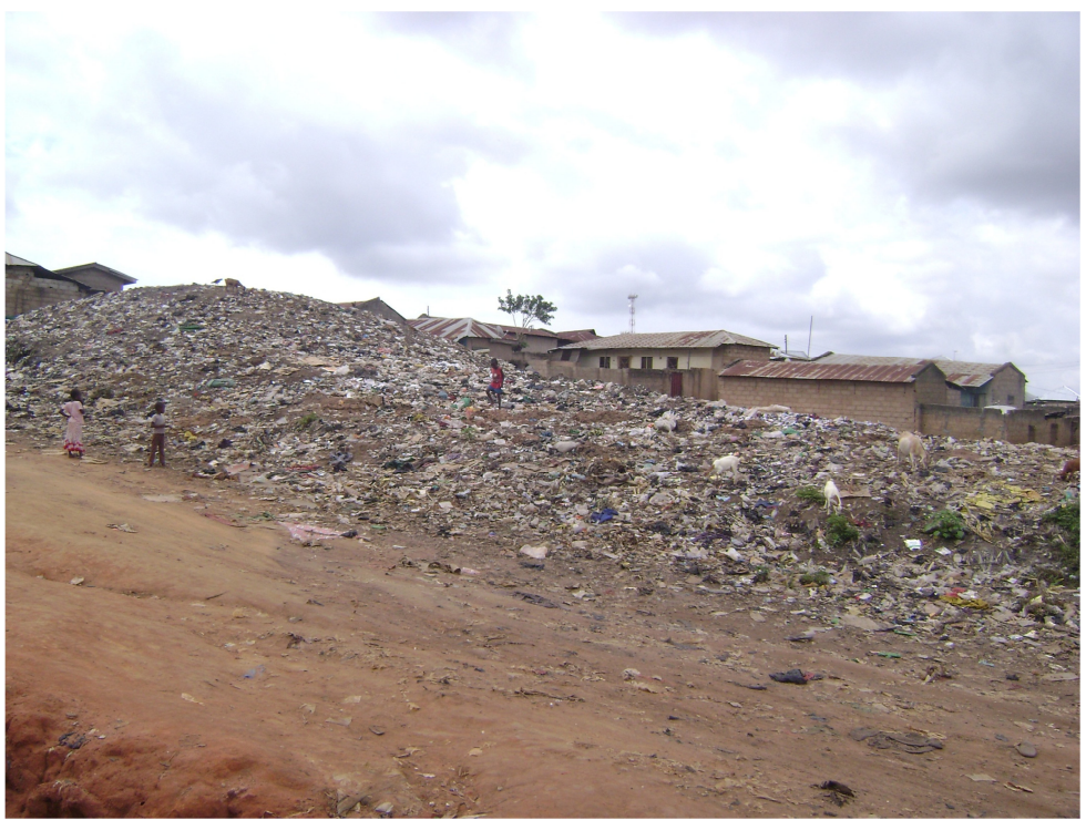
Fig. 3 Emir Palace dumpsite

Soil samples were taken between 0-15un in four different locations of the two dumpsites shown in fig 2. into a pre-washed cleaned polyethylene bags between the month of September and October, these dumpsite are Jos Road dumpsite and Emir Palace dumpsite. Each of the samples from each dumpsite were mixed to obtained a composite sample of two and these two were transported to the laboratory and air dried at room temperature for two weeks, after which it was grinded using mortar and pestle, the grinded samples was sieved using 0.2 mm sieve size and bottled in a polyethylene bottle at room temperature before extraction. Water sample was also collected in three different points in the river located closed to Emir Palace dumpsite as indicated in fig. 2. into a cleaned polyethylene bottle, the PH, conductivity and TDS were determined insitu using Hanna digital PH meter and sprite conductivity meter. While the elemental analysis was carried out in the laboratory using standard methods (APHA 1995).