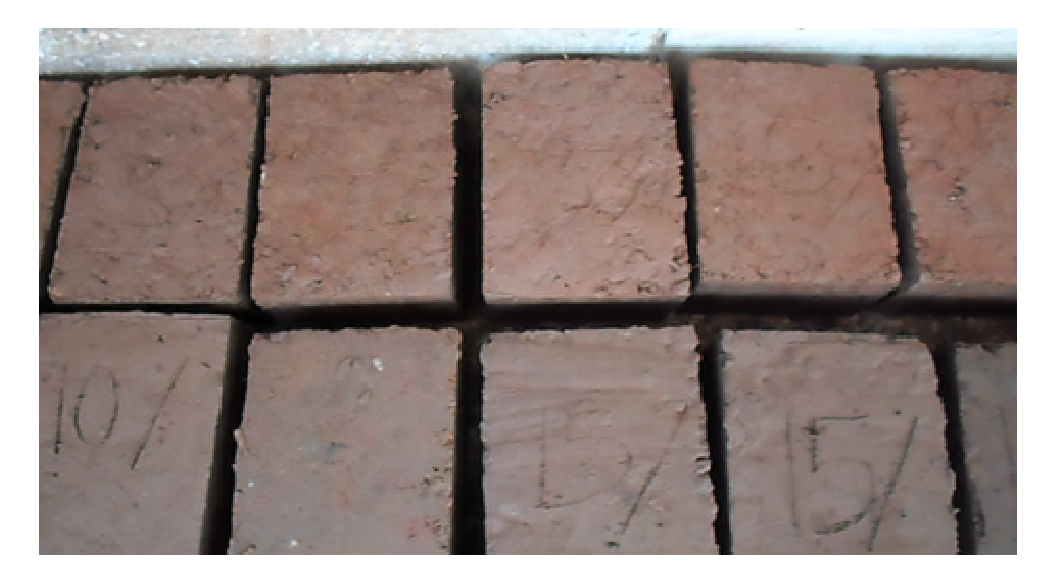
Figure 1. Moulded Soil bricks

The soil and corn husk ash were thoroughly mixed with spade and compacted manually. With five different batches (0%, 5%, 10%, 15%, and 20%), 15 soil blocks with nominal dimensions 200\text{mm} \times 150\text{mm} \times 100\text{mm} were produced from each batch. The soil blocks were initially covered with damp plastic sheets and sacs for the first 7 days which [10] averred that it was essential as this prevent surface shrinkage cracking due to rapid evaporation which tends to promotes undesirable loss and uneven distribution of moisture in the blocks. The sheets were then removed after which the soil blocks were air dried at room temperature for the remaining 21 curing days as shown in Figure 2 and Figure 3. Laboratory tests were conducted on the soil blocks to evaluate their compressive strength, water absorption and abrasion resistance properties.