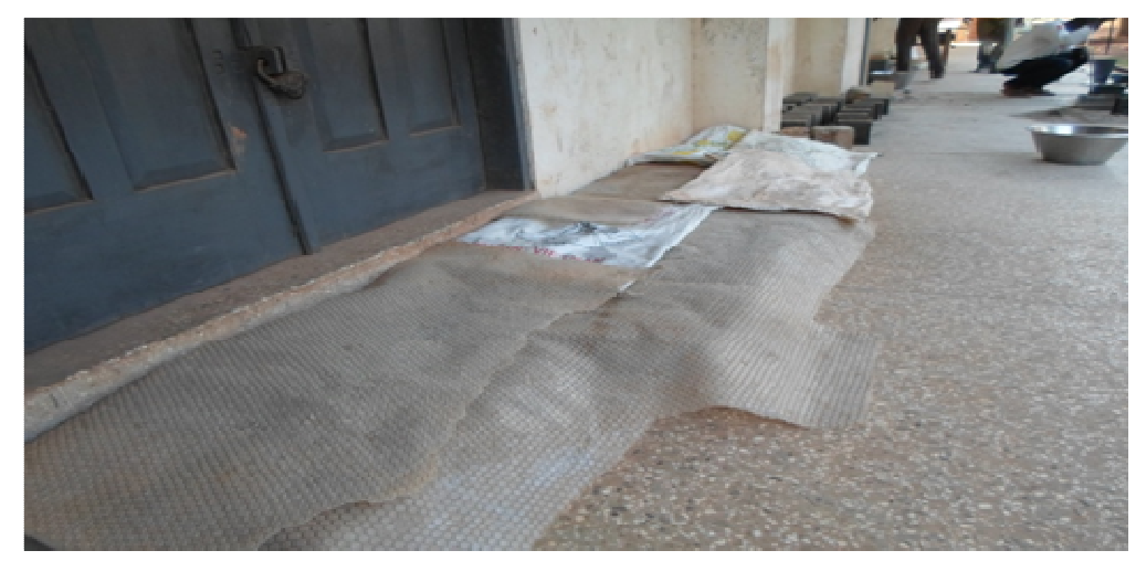
Figure 2. Curing of bricks using Plastic sheets