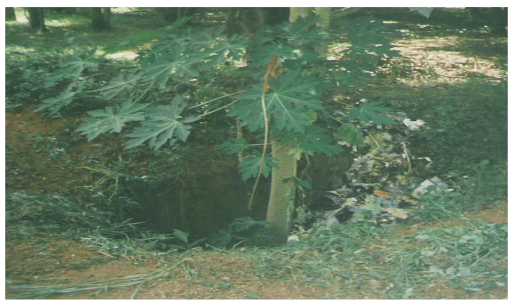
Plate 4: Dump Pit for open burning of waste in the leprosarium