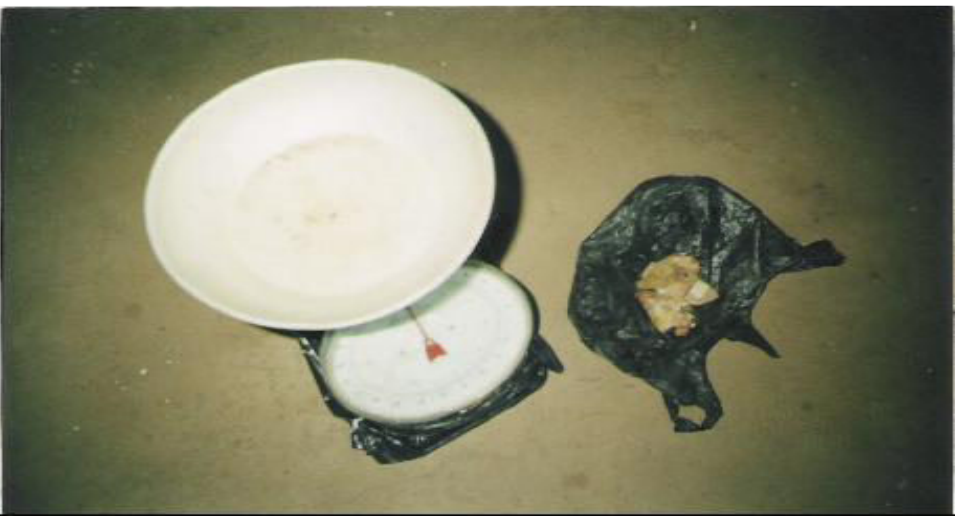
Plate 1: Absorbent and Swab as Bio-medical Waste from Leprosarium