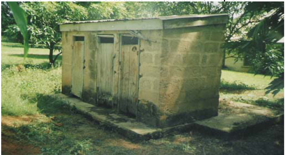
Plate 2: Pit Latrine in the camps provided for the patients