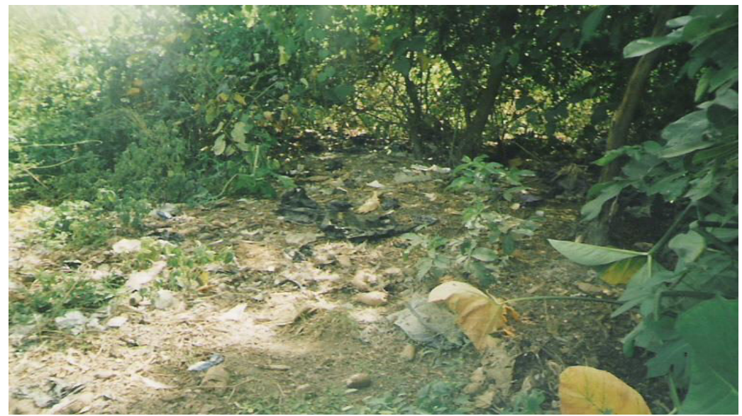
Plate 3: Open Dump Site in the Colony

The waste had the mean moisture content of 45.9% which is low as a result of high content of dry waste material it contained, for example wood ash [13.3%] and yard trimmings [30.8%], in addition, the study was done during the dry season.