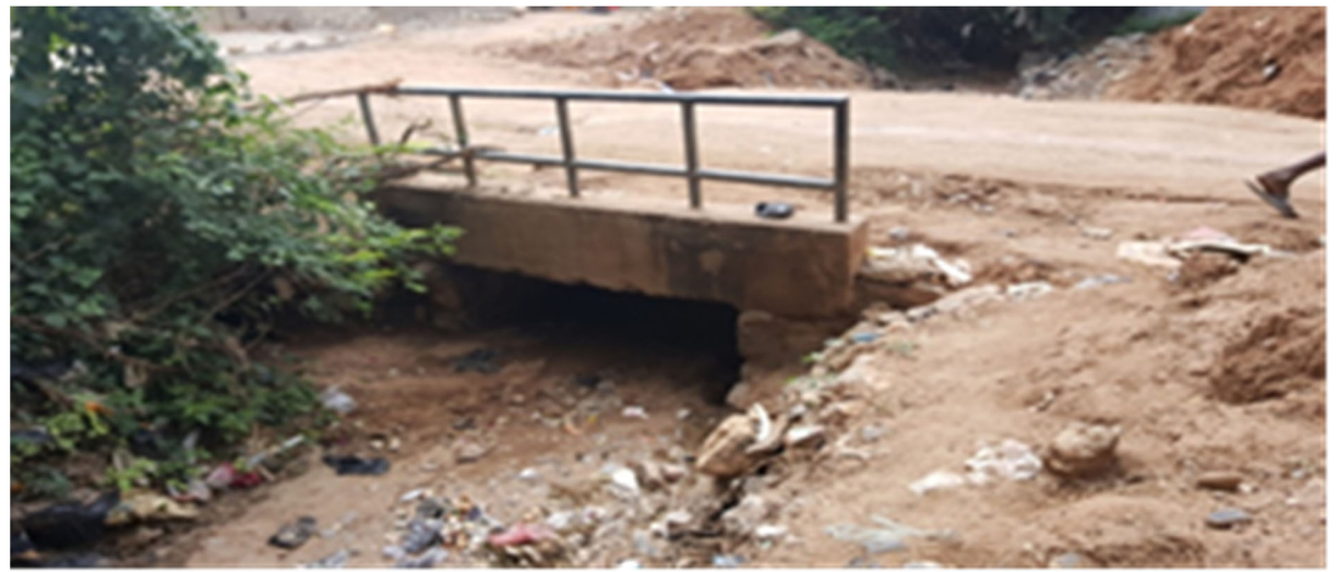
Figure 3: Almost all filled with the sedimentation of side ditches