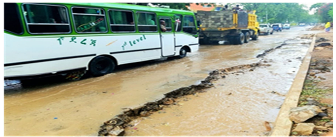
Figure 5: Flooding to both the right and left side of the drainage system