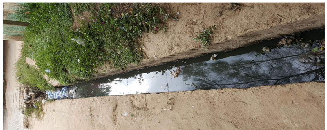
Figure 4: Solid waste and dust accumulation in the drainage system and creates water stagnation in the side channel