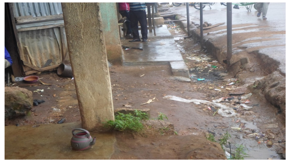
Plate 1: Blocked drainage from informal sector activity

The poor surface drainage in urban areas as a result of informal land use activities, leads to stagnant pools where mosquitoes and other disease carrying vectors breed (see plate 1). Often in towns and cities, public drains are used as substitutes for toilets and waste disposal facilities. This causes blockage of the drains and is usually responsible for environmental problems such as flooding, erosion and landslide, which destroy homes built on marginal land, and causes major damage to public infrastructure and private property.