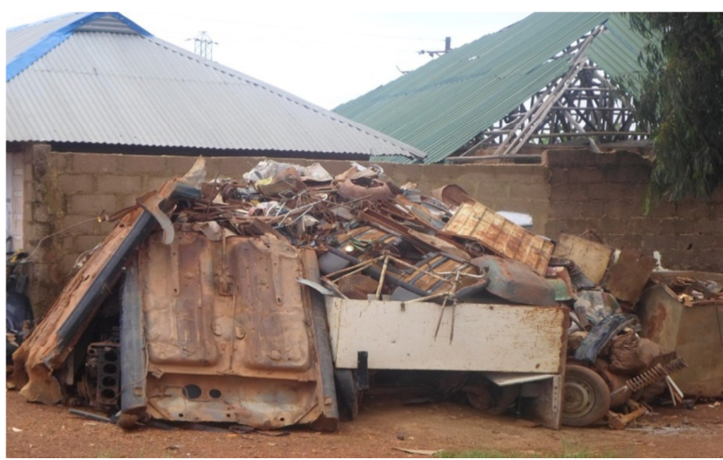
Plate 3: Scrap metals generated by the informal sector in Barkin-ladi town.