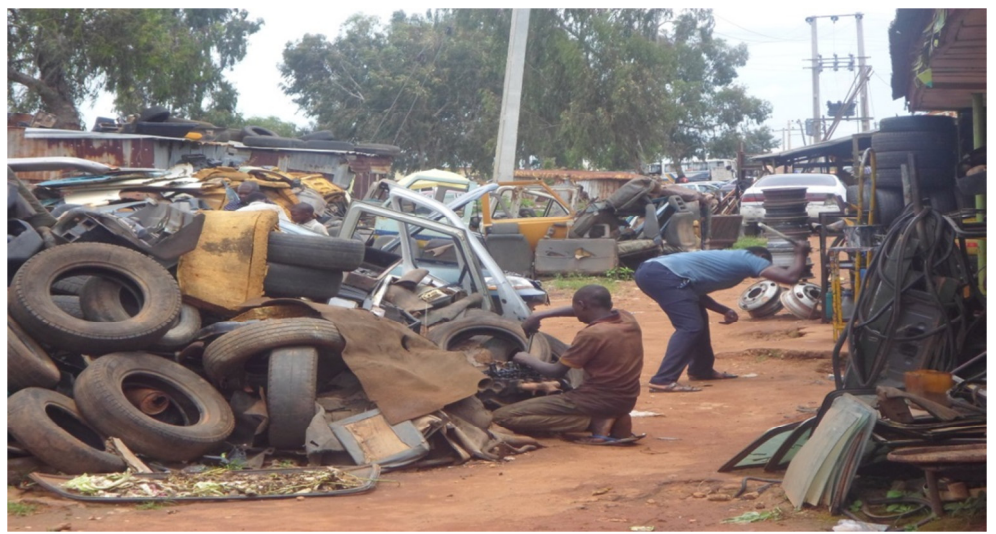
Plate 1: Nature of waste generated from Tertiary services in Barki ladi