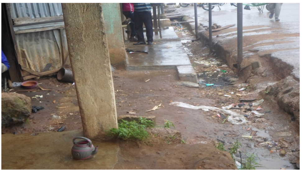
Plate 2: Blocked drainage from informal sector activity