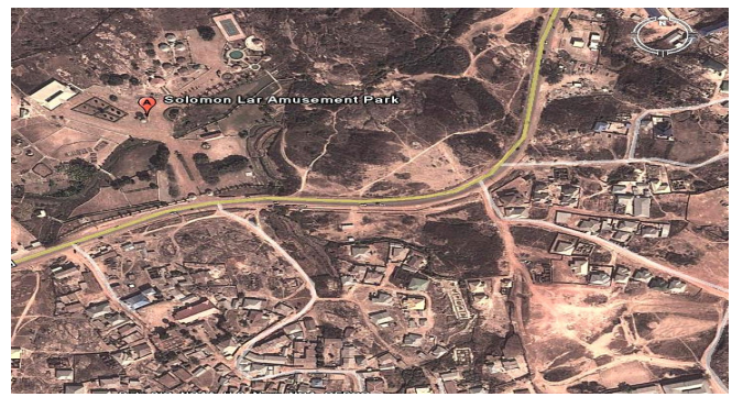
Plate II aerial view of Tudun Wada.