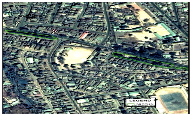
Plate IV aerial view of Zaria Crescent.