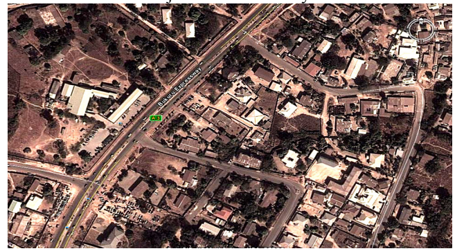
Plate I aerial view of Anglo-Jos.