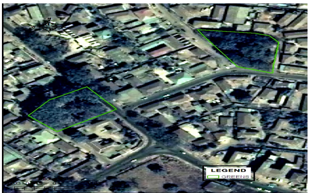
Plate III aerial view of Tafawa Balewa and Vander Puye.