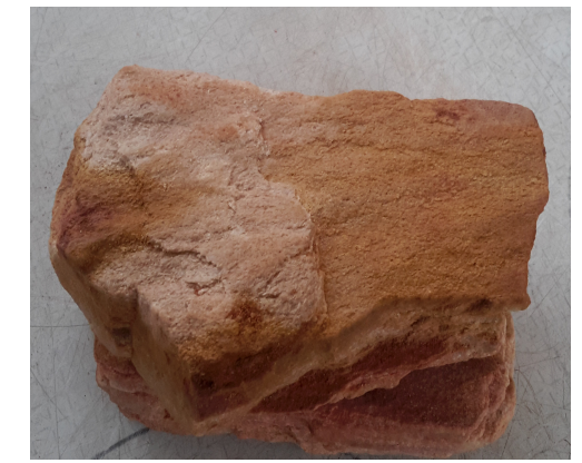
Metasandstone (Q1 Quartzite)

Three different types of quartzite have been identified as the source of mineral aggregates for concrete production in parts of Southern Ghana. They include quartzitic sandstones, thin layered quartzite and metaquartzite and have been classified as Q1, Q2 and Q3 quartzite types. The quartzite types have presented different strength values which correspond to their degrees of metamorphism. The Q3 quartzite has the highest strength and metamorphism and may be most useful for concrete suitable for structural work. The Q1 quartzite is the least metamorphosed as indicated by the presence of some sedimentary features.