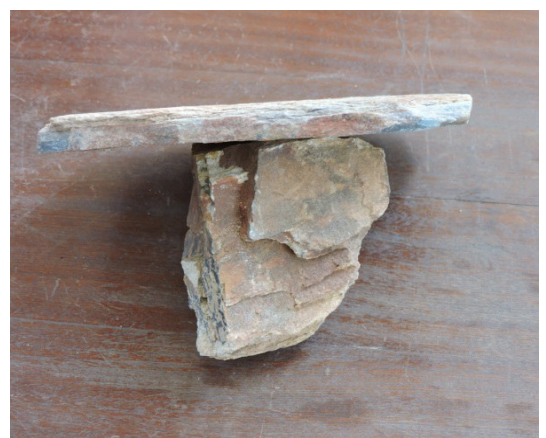
Thin Layered Quartzite (Q2 Quartzite)

base material for buildings. The glassy luster of Q3 quartzite however, may cause weak bonding between the aggregate and cement mortar due to its smooth surface. The Q3 quartzite rock aggregate have angular shapes and could form good interlocking network which makes it superior aggregate over rounded aggregates in terms of strength.