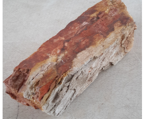
Thin Layered Quartzite (Q2 Quartzite)