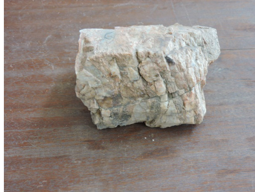
Jointed Metaquartzite (Q3 Quartzite)