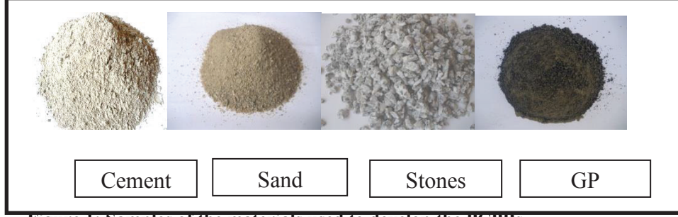
Figure 1: Samples of the materials used to develop the PCPBs

Ordinary Portland cement (OPC), fine aggregate (sand), coarse aggregate (stones), ground plastic (GP) and water were the materials used to develop the plastic concrete pavement blocks (PCPBs). Samples of the cement, sand, stones, and ground plastic used are shown in Figure 1.