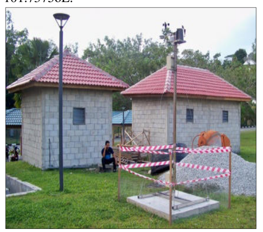
Picture 1*: image of experimental set-up * Note: This picture is COPYRIGHT @ 2012 by Authors / Research Team / RMC. All rights reserved.

The Experimental setup is located inside the (Refer to figure 1) at International Islamic University Malaysia (IIUM) campus, Gombak, Kuala Lumpur, Malaysia. IIUM is located at latitude 3.2530 N and longitude 101.7375oE.