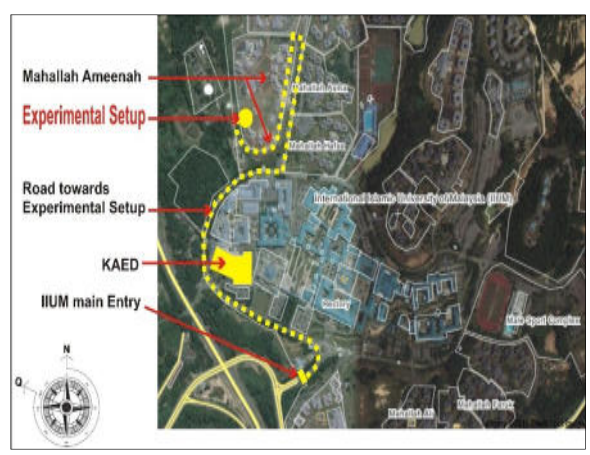
Figure 1*: Location of experimental set-up * Note: This figure is COPYRIGHT @ 2012 by Authors / Research Team / RMC. All rights reserved.