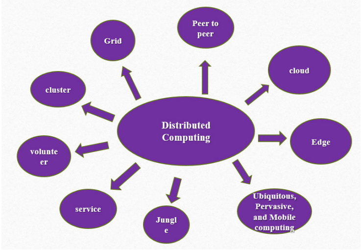
Figure 1. Main distributed computing paradigms

It made possible the technological progress in network speed and bandwidth of the emergence and evolution of distributed computing. It began in the 1960s in the message-passing communication between two or more computing resources. Then the local area network, ARPANET, and especially the introduction of email service marked the 1970s The use of distributed computing has undergone a major expansion that benefits from the availability of computing resources powerful and network speed to the public at low cost. Solving large complex problems is considered extremely difficult to resolve became possible. In this section, the main distributed computing paradigms shown in Figure 1.