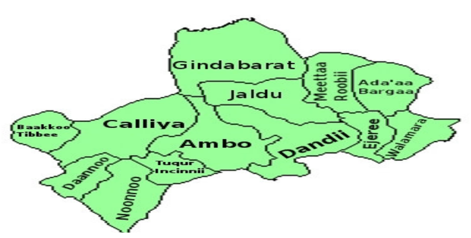
FIGURE 1: MAP OF BAKO TIBE DISTRICT

High forest, woodland, riverine, shrub and bush, savanna and manmade forests are available in Bako Tibe District. According to Bako District Agricultural Office (2017) there are about 127,615 cattle, 3,438 sheep, 11,600 goats, 9,709 horses, 9,200 donkeys, 4,668 mules and 8,033 Poultry in the district. Climatically, the district is classified into dega (12%), woinadega (35%) and lowland (53%) zones. Most of the areas in the district range in altitude between 1600 m.a.s.l. and 2870 m.a.s.l. The vast area of the district receives rainfall between 1000 mm and 1500 mm. The annual mean temperature ranges between 13.2 °c - 32°c. The area receives maximum rainfall in the months of July and August. There are four government and private Technical and vocational colleges, there are two secondary and preparatory schools, there are a number of elementary and junior secondary schools, there are a number of kindergarten schools as well. Educational coverage reached about 87% as of Bako Tibe District office of Education, 2013. Besides there is 24 hours serving hydropower electricity source, digital telecommunication service, Ethiopian commercial Bank, Awash International Bank and Oromia International Bank in Bako Tibe District are some of financial institutions...such as Oromia Credit and Loan Association.