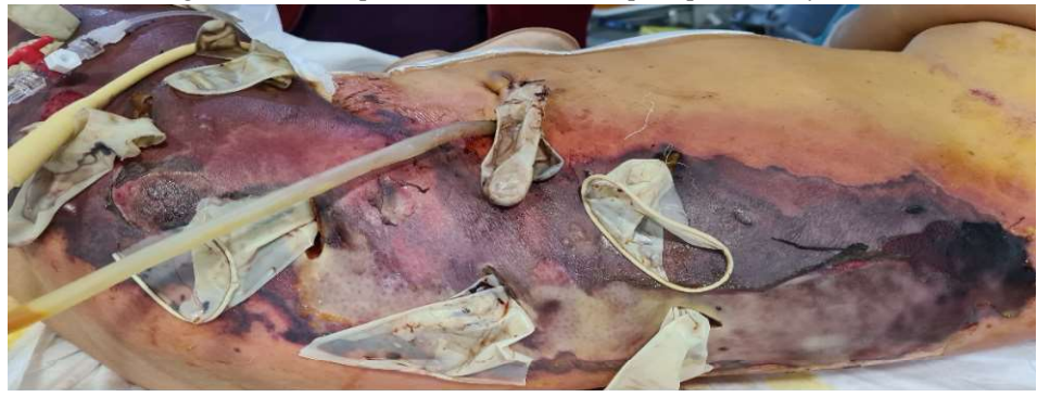
Figure 4. Illustration of six day of ecchymosis post operation

On following days, the patients wound was treated locally several times a day and antibiotics were changed according to antibiogram. The supportive treatment in the ICU was changed continuously according to patient conditions. Nevertheless, the patient enters MOF stage, the local condition progresses to gangrene expanding to perineal area and to the right side and the patient dies on the ninth postoperative day.