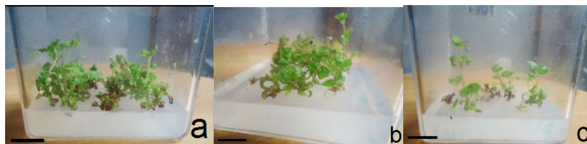
Figure 1. Shoot initiation from in vitro germinated seedling on MS medium enriched with a) 1.5 mg/l BAP, b) 0.5 mg/l BAP, c) 0.5 mg/l KIN. Bars = 1 cm

Means within columns having different letter (lower case) in superscript are significantly different at p < 0.05 .