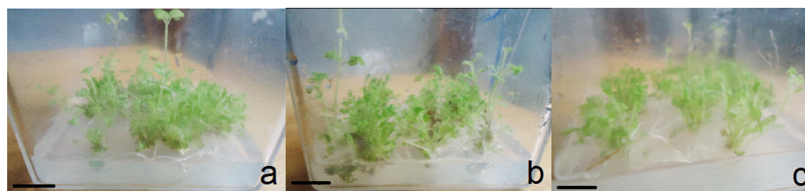
Figure 2. Shoot multiplication on MS medium enriched with a) 1.25 mg/l KIN, b) 1.75 mg/l BAP, c) 1.75 mg/l KIN. Bars = 1 cm.

Means within columns having different letter (lower case) in superscript are significantly different at p < 0.05 .