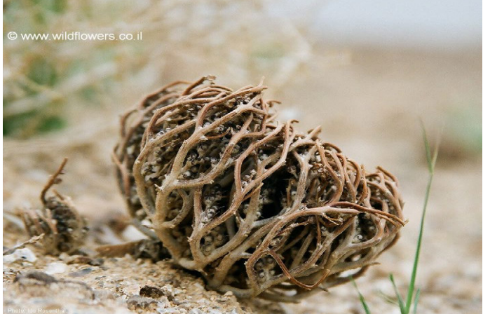
Figure 1: Kaffe Maryam [9]

A. hierochuntica L. (Family: Brassicaceae) locally called 'Kaff-e-Maryam, is a well known desert zone medicinal plant. Novel melanogenisis inhibitor flavonoids with antioxidant potential were isolated from it [5,6]. Kaff-e-Maryam is a monocarpic annual plant species characterized by topochory/ ombrohydrochory type of seed dispersal [7-8] (Figure 1).