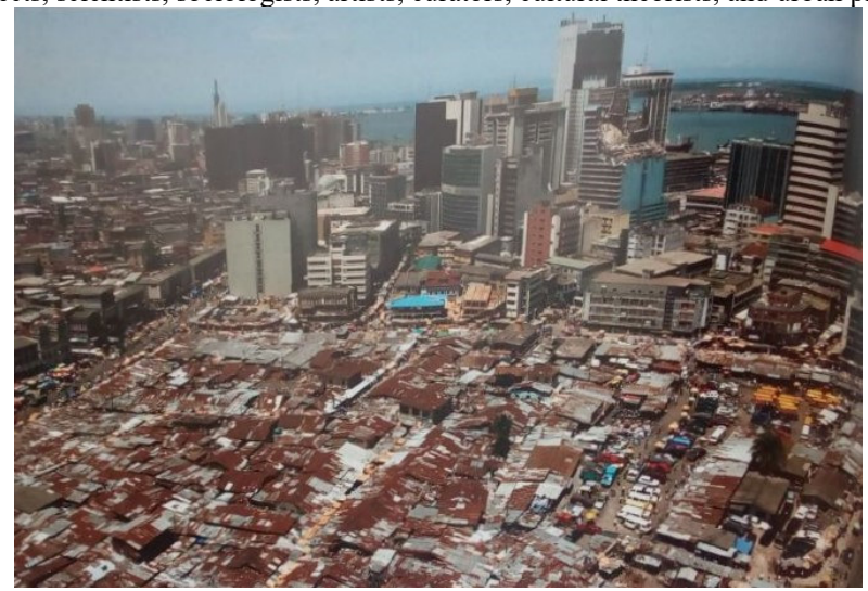
Figure 2, Akintunde Akinleye/Reuters: Lagos Paradox , 2010. ©LagosPhoto.

the city of Lagos a permanent aspect of the festival (Nwagbogu, 2015). The general public- taxi drivers, street hawkers, and passers-by become participants in experiencing the beauty that would have been the preserve of a few. Nwagbogu explains that the attraction of the public space initiative is its facilitation by established professional architects, scientists, sociologists, artists, curators, cultural theorists, and urban planners.