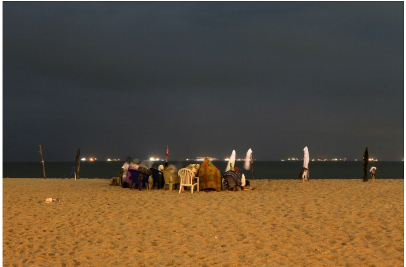
Figure 3, George Osodi, Bar Beach, 2010.

Lagos Photo's inaugural festival was held in 2010 with the theme No Judgement: Africa under the Prism. It featured a total of 25 artists made up of 11 Nigerian photographers and others selected from parts of Africa, Europe and America. Among these photographers are Tam Fiofori, George Oshodi and Akintunde Akinleye. Other photographers included in the festival are Viviane Sassen (who exhibited her work titled Flamboya and works from her dream series which explored the existential and imagined realities of Africa), Akintunde Akinleye's Lagos Paradox and Adolphus Opara's documentation of the increased popularity of Rugball, a sport that combines the rules of football and Rugby, capture the historic rustic, lively and bustling character of the city of Lagos.