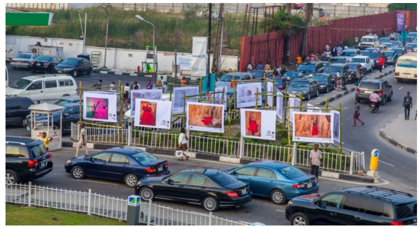
Figure 7, A Lagos Photo outdoor exhibition at Falomo Roundabout, Ikoyi, Lagos, 2015.