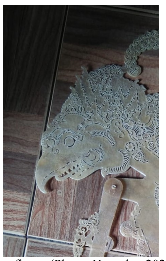
Picture 13. Wayang putihan (uncolored wayang) of Garudeya figure

The uncolored puppets of the Garudeya character were painted according to the general coloring rules for shadow puppets. The sungging process started from coloring using a white base color. In the next step, painting was done in layers or disungging .