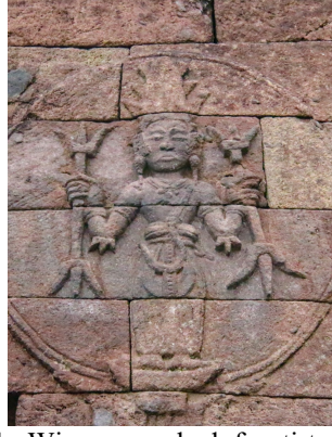
Picture 3: Garudeya, Dewi Winata's child (Photo: Picture 4: Wisnu searched for tirta amerta (Photo: Esha Karwinarno, 2022)