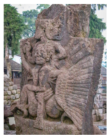
Picture 7: Garudeya snatched tirta amerta from the Picture 8: Garudeya became Vishnu's vehicle