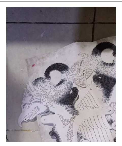
Picture 14. A base color painting (sunggingan)