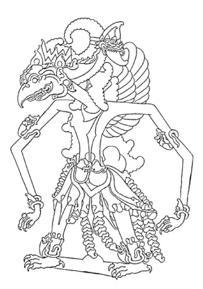
Picture 12. Garudeya puppet character design (Designer: Sunardi, 2022)

The design of the Garudeya wayang figures was produced using buffalo skin as the raw material for leather puppets. The patterning technique became the next creative work by transferring the design from paper to buffalo skin. After the image was transferred to buffalo skin, the carving was done so that it became a white puppet form because it has not been colored so that the skin is in the form of a Garudeya character.