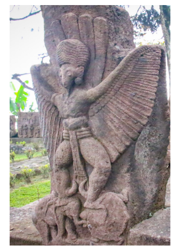
Picture 9. Garudeya character figure (Photo: Esha Picture 10. Garudeya figure grips the Elephant and Karwinarno, 2022) Turtle (Photo: Esha Karwinarno, 2022)

The reliefs of Garudeya are depicted as anthropomorphic figures. Anthropomorphic figures are defined as depictions of the human form combined with animal, non-animal, or other ideational forms. The depiction of animal shapes is emphasized on the head, while other body parts depict humans (Sugihartono, 2012, p.1). If we pay attention to the figure of Garudeya, he has a large, tall human body with a bird's head, wings, and a tail. Garudeya wears clothes and accessories like those worn by humans in his day.