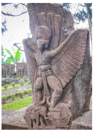
Picture 5: Garudeya took care of the Dragons Picture 6: Garudeya's journey in finding tirta amerta