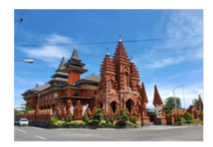
Figure 1. The Holy Spirit Cathedral Denpasar Building in Bali