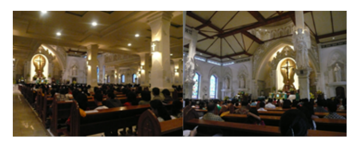
Figure 4. The Atmosphere of Worship Activities of the Holy Spirit Cathedral Denpasar