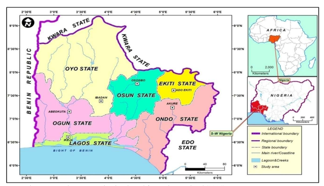
Figure 1: South Western Nigeria adapted from Ojo & Saheed (2014)

The study area was the six capital cities in South-West Nigeria as Figure 1 illustrated. The survey was carried out in the six capital cities in South-West Nigeria which include Ibadan, Ikeja, Abeokuta, Osogbo, Akure and Ado-Ekiti as the target study area. The cities were chosen based on the fact that the practice of Architecture as a profession mostly serves the elites of a society and as such those who are the-would-be clients of architects are based in the major cities of Nigeria. Thus, their offices were mostly located in the capital cities of any state in Nigeria.