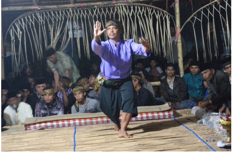
Figure 3. An example of the ulu ambek sapangka player performing the first role as the 'pe- ulua ' (attacker).

Ulu ambek performances are directed by a janang , who guides and regulates the performance. Each performance lasts about 7-10 minutes. The players take up their position, with the sapangka player at the front and the invited player, or alek standing inside. The ulu ambek sapangka player has the role of making the first attack, while the role of the luak-lareh player is to rebut or block the attack. The first movement performed by both players is a display of deference and apology to all those present. This is compulsory for all ulu ambek players. As they listen to the text and the dampeang melody, the music that accompanies the ulu ambek performance, they continue to move cautiously, waiting for a certain code or text, at which moment they immediately take up their position and become involved in the performance, interacting without any direct contact. About half way through the performance, the janang closely observes both ulu ambek players. If one of them begins to play too roughly or to endanger his opponent, the janang gives a warning, by uttering the words " elok main " (please play nicely).