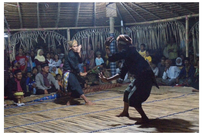
Figure 4. An ulu ambek performance taking place at night appears more visually artistic and aesthetic from the aspect of the audience.

The ulu ambek players who perform, both from the sapangka group and the luak-lareh community, take heed of the calls and warnings of the janang . If the play starts to become dangerous, the janang has the right to stop the performance. The janang is given the mandate by the ninik mamak to lead and direct the ulu ambek performance with a high sense of authority and responsibility. If chaos or confusion arises as a result of the janang 's negligence, that particular janang will not be used again in future performances.