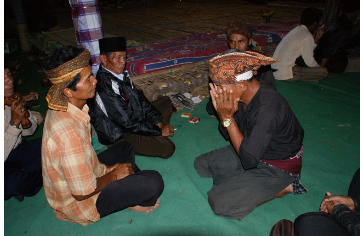
Figure 1 . Every ulu ambek player who is about to perform must first greet the elders and other ulu ambek players from his own lareh community who are seated in the aisles. When he enters the laga-laga stage, the player also greets all the ninik mamak , religious leaders, and intellectuals seated on the laga-laga in the same way.

The ulu ambek luak-lareh groups that arrived earlier in the night are requested respectfully by the kapalo mudo sapangka to present a performance of randai ulu ambek (a section of the ulu ambek performance). This also applies to the other ulu ambek groups, all of which are asked to perform randai ulu ambek . The main ulu ambek performance (a contest between a pair of ulu ambek players) takes place the following day, from late morning until evening. For the ulu ambek luak-lareh communities, the ulu ambek performance is based on negotiations that take place on the laga-laga , involving the ninik mamak and all the main elements related to the ulu ambek performance. The ulu ambek communities that arrive earlier and have teenage ulu ambek players are given priority to perform first. The teenage ulu ambek players are given the opportunity to perform first to motivate them and also so that they will be able to watch the subsequent performances by adult groups. For all ulu ambek communities, these teenagers are the cadres who will continue to become future ulu ambek players.