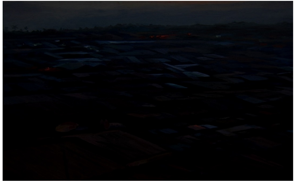
Figure 10. Night

Conceptually, society is consisted of people with diverse character traits, which, like colours or objects, could be differently observed, according to the distance between the object and the viewer. Like the hues of colour, the temperaments or characters of humans are best observed when living close to the one. The further one is from another, the more difficult it becomes being familiar with the one's life or character.