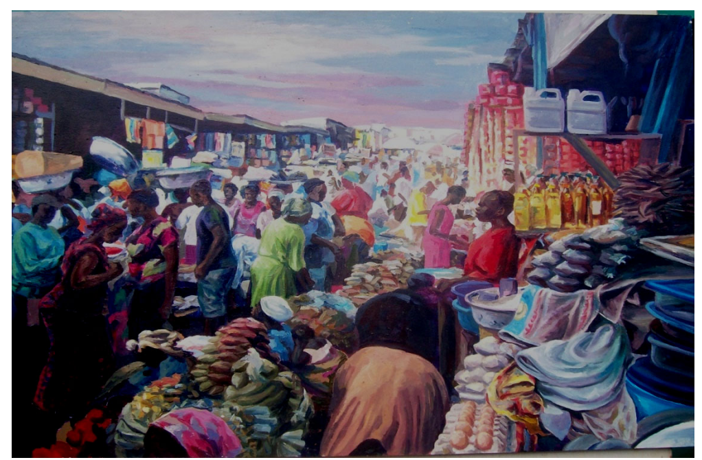
Figure 9. Evening