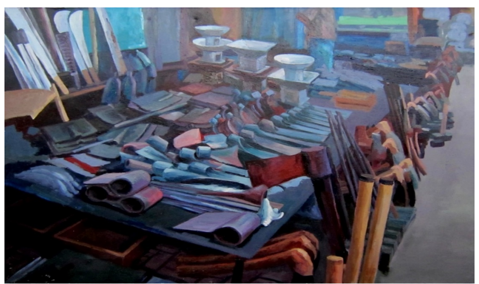
Figure 3. Spaces in Front of Stores for Table, Wares and Human Traffic