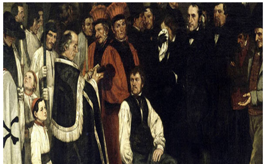
Figure 6. Burial at Ornans-(Figure 4). (Gustave Courbert -1849-51, the Launch of Realism) <a href="https://www.theartstory.org/movement-realism.htm">https://www.theartstory.org/movement-realism.htm</a>