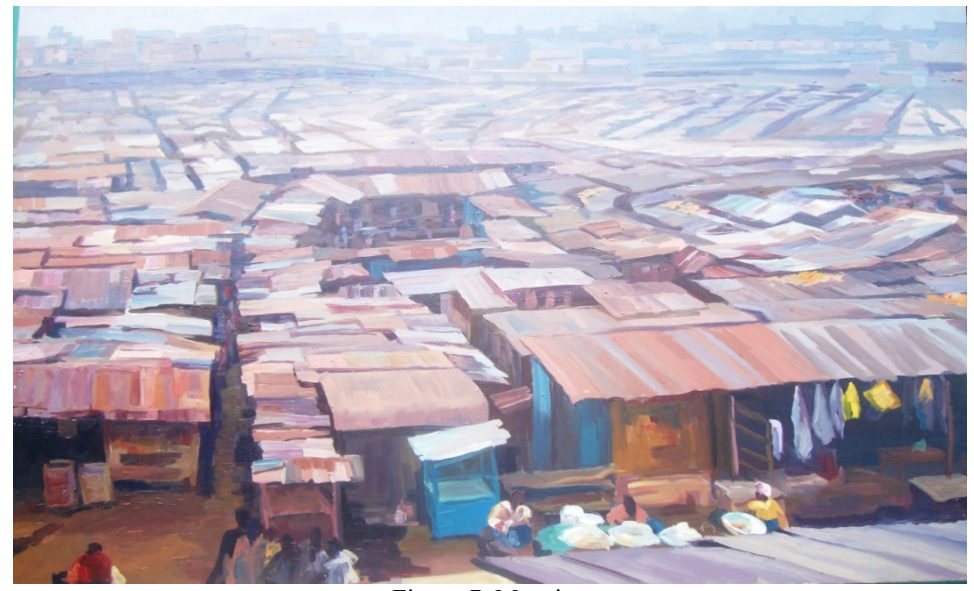
Figure 7. Morning