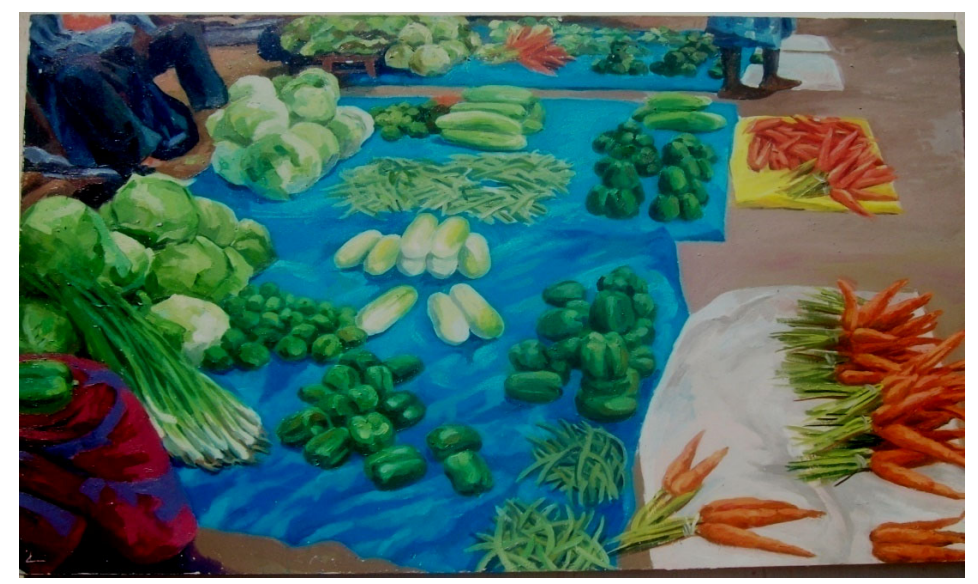
Figure 2. Spaces in-between wares