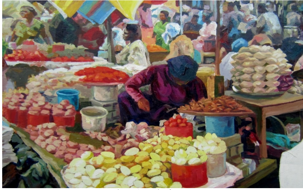
Figure 1: Lack of Space

The use of colour to visually portray time cannot be limited only to the paintings of the four periods of the day. The commonest and widely accepted forms of time are usually what are displayed by watches and clocks. There are two types of time displayed by the said watches and clocks which are in the manual and digital forms. Both the manual or digital types cannot be visually displayed without colour. With the manual, it is colour that makes the figures which read the current time visible to the eye, whether embossed or engraved. The digital type is always in the form of bright light colour mostly in black or red. In spite of the artistic nature of the watches or clocks, it is only the time which is the reason of the watch or clock being purchased. If the system that displays the actual time malfunctions, the significance of the watch or clock is utterly reduced, and as such, the owner quickly has to see to its maintenance.