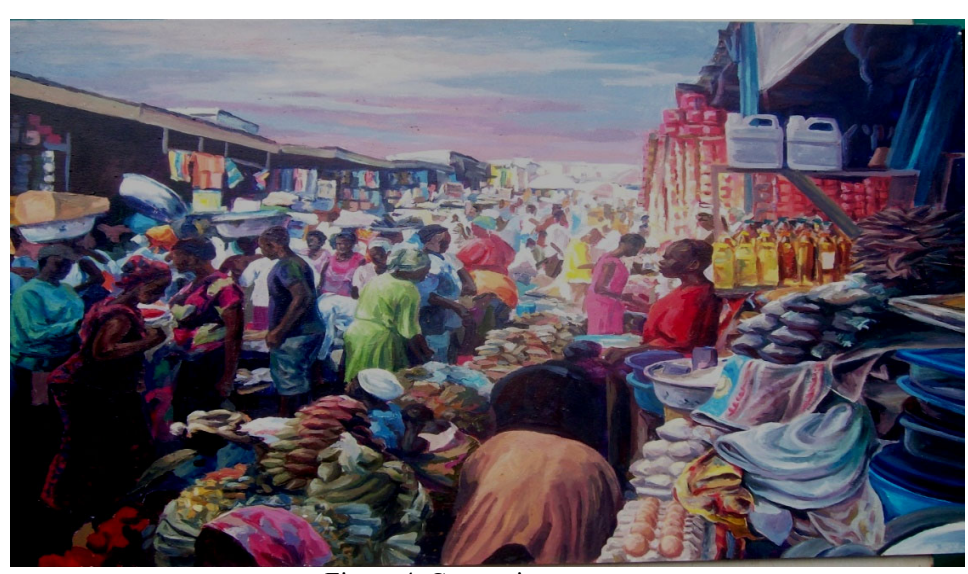
Figure 4. Congestion on space