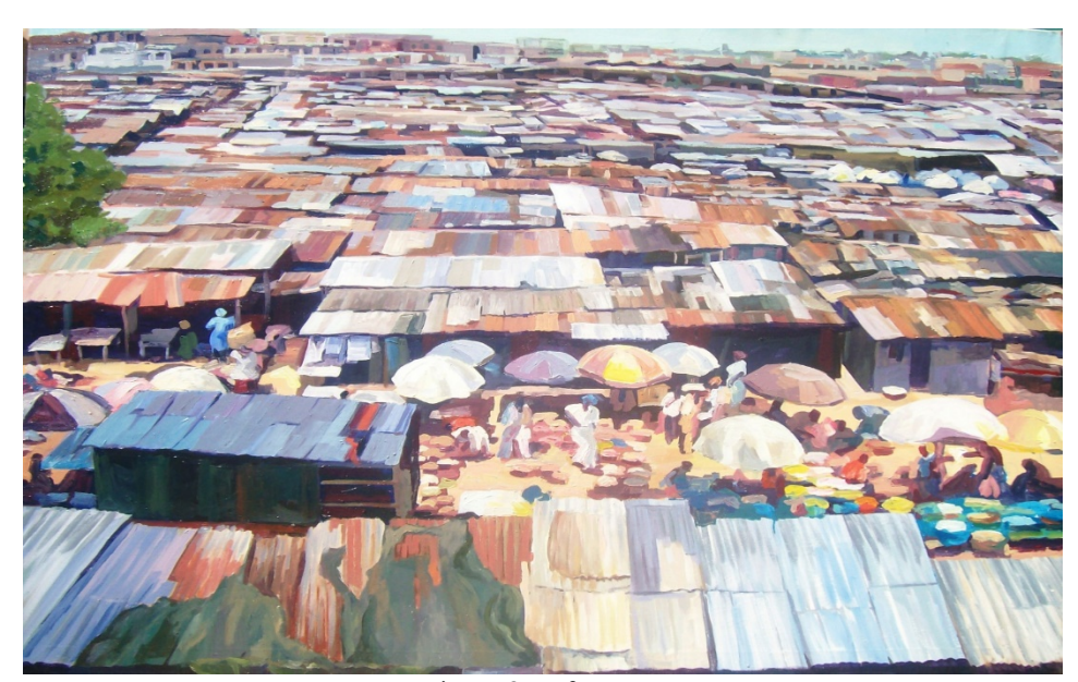
Figure 8. Afternoon