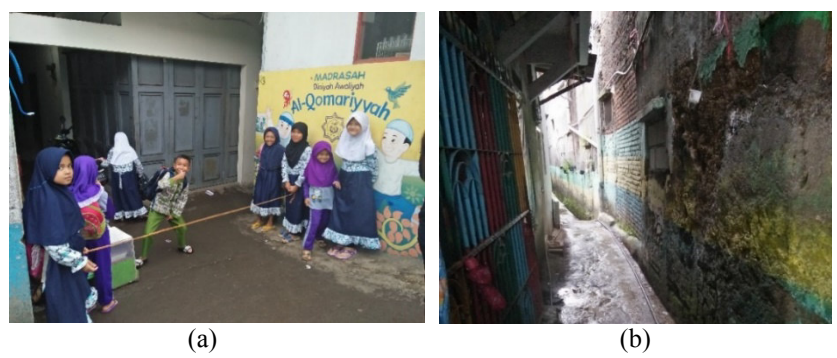
Figure 3. (a) Open area before the alleyway used as the santri's playground. (b) Alleyway access to MDA Al Qamariyyah

MDA Al Qamariyyah is located within a house of a local resident. The house itself is coinciding with another house due to the densely populated area. The learning process is conducted within the two rooms inside the house which is being converted into a 3 x 5 meters classroom. The house also has a porch about 1.7 x 6 meters. Right in front of the house there is wall of another house with a pre-existing mural artwork that is already deteriorating. After being discussed with the manager, a new mural artwork will be created on that wall, replacing the pre-existing one. Other activity that is being done at this step is to interview the managers of MDA Al Qamariyyah. From the interviews, it is revealed that the people's awareness for the environment around the madrasah's vicinity is poor. They do not understand waste sorting and trash management, and still dump their waste to a nearby river. Therefore, it is agreed that one of the themes displayed on the new mural will be about environmental literacy. This theme is also aimed at the parents of the students because the wall used for the artwork is within sight of the parents' waiting area.