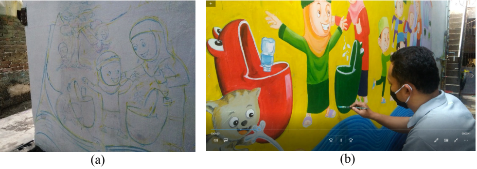
Figure 5. (a) Sketching the mural (b) Coloring the mural

In the finishing as the last phase, observation on the wall as the art medium is made. The dimensions for the wall that is being prepared and used for the artwork is 2 x 4 meters. The surface conditions of the wall are flat enough to ease the work on each stage of the visualization. The visualization process is done in steps. The first step is to cover the whole medium with white paint to ease the process of creating the sketch and coloring in the next step. The sketching process is basically transferring the previous sketch made on a worksheet to the sketch on the wall. The result of the sketching process is the rough image of each objects with clear and thick lines to ease the process of coloring.