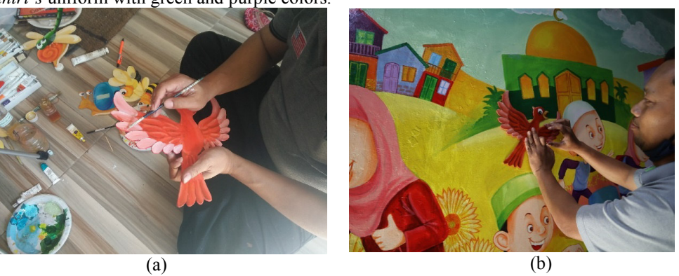
Figure 6. (a) Creating the visual element for the mural (b) Placing the visual element on the mural

The coloring step is done in phases both for object and background color. The paint used is a high-quality acrylic paint. Coloring starts by brushing color evenly on the object fields according to previous planning and sketching. Shading is also done to give a feel of depth. The coloring step is quite intense, especially during shading. Color gradation is shown smoothly. Color selection for this artwork is dominated by contrast color selection such as yellow-blue-red-purple-green. For the landscape, yellow and turquoise blue is used. The figures shown uses appropriate colors according to their respective objects, while the identity of the institution is shown on the santri 's uniform with green and purple colors.