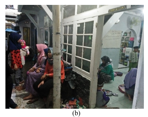
Figure 4. (a) The wall used for the artwork. (b) View of MDA Al Qamariyyah's porch.

Second step is the elaboration step. From the results of observation and interviews, main ideas are brought up as references for the artwork. The main theme for this artwork is to show a learning atmosphere full of environmental literacy concept. Within this artwork, the following objects are shown: (1) The figure of santri . The artwork carries the theme of children as santris that have a passion for learning. The identity as a santri is visually shown through the depiction of uniforms used by the santris of MDA Al Qamariyyah. Other than the figure of santris , the figure of women teachers ( ustadzah ) is also shown along with their Islamic identity through their clothing. Other figures include animals which the kids are familiar with. (2) An imaginative background. Background is an important piece in supporting a theme because it strengthens the message conveyed. The background used shows an outdoor environment with river, settlements, a masjid, and the madrasah. This background concept is aimed to give imaginative experiences for the children. (3) Fantasy objects. These objects are shown to add an imaginative atmosphere. The objects are a depiction of items used to study associated as a living creature.