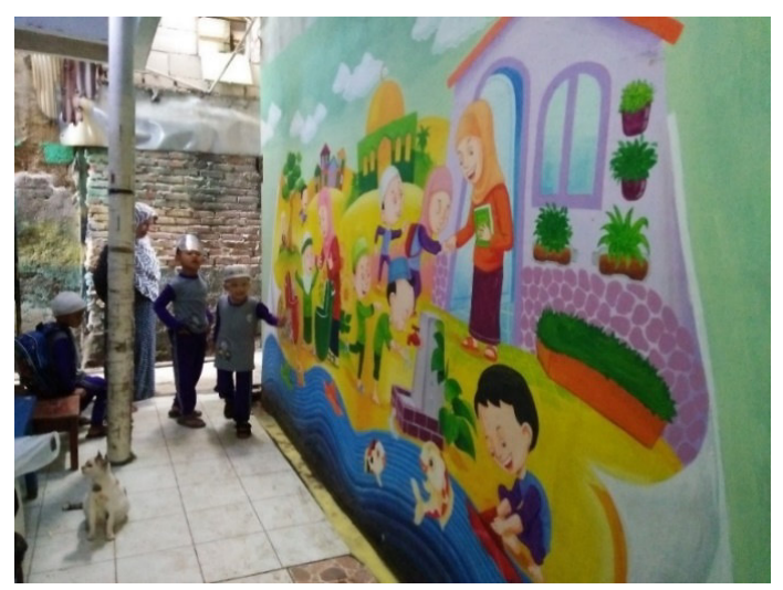
Figure 7. Final result of the mural artwork

These are the artwork's analysis by observing the environmental literacy education content on each of the presented fragments: