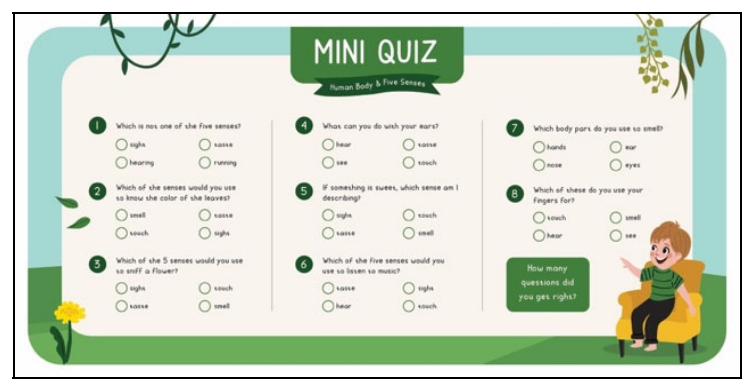
Figure 15. Mini Quiz Pages (Sergio, 2020)

The composition of design elements is arranged in such a way as to resemble a quiz question but decorated with leaves to maintain a syntactic relationship with the previous pages. Likewise, the consistent use of analogous colors (blue-green-yellow). This interactive book has been tested on grade 1 elementary school children, aged 6-7. Enthusiasm proved that books with interactive activities and attractive and fun layouts and visuals can help and improve the process of understanding difficult material.