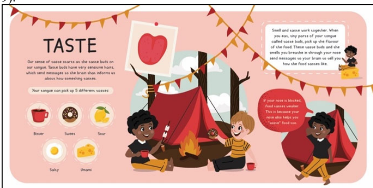
Figure 9. Sense of Taste Pages (Sergio 2020)

The next sense is the nose, which is used for smelling. The atmosphere is illustrated in a garden in the