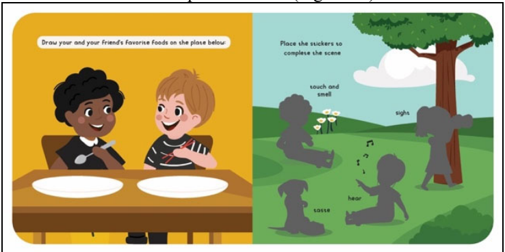
Figure 14. Activity 3<sup>rd</sup> and 4<sup>th</sup> Pages (Sergio, 2020)

On the next page, two activities are requested, namely describing favorite food on an empty plate, and attaching a picture or sticker according to the existing silhouette of the image. he results obtained will show the three characters doing activities related to the five senses, such as listening to music, looking through binoculars, touching and smelling flowers, and eating. Yellow reddish is used for the dining room, because shades of yellow reddish (orange tone) can arouse appetite (Spence, 2015). Meanwhile, on the right page, the atmosphere of the playground is dominated by green and blue, to create a beautiful, cool, and pleasant environment. This game requires careful eye in selecting and pasting objects as requested (Figure 14). The next page is the final activity in this book, which is a mini quiz, where eight questions choose the correct answer. Dominated by green and white, it creates a clean, healthy and fresh impression. A child sits on a chair and is placed in the bottom corner of the right page. Boys who are sitting can be used as an example of a learning position to do a good question is sitting, so they can concentrate and answer the questions well (Figure 15).