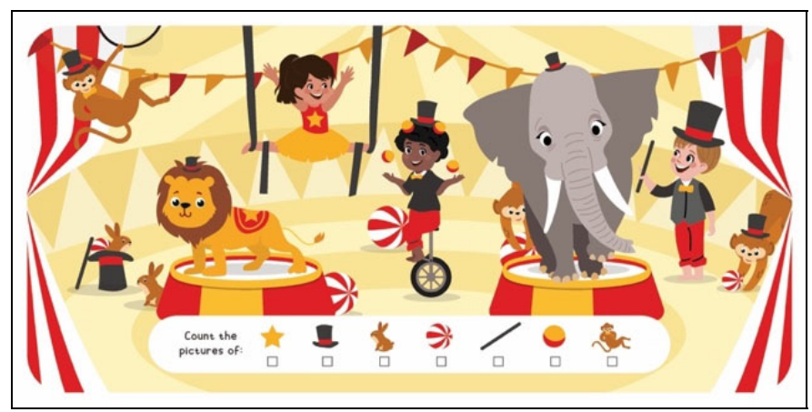
Figure 12. Activity Find the Images Pages (Sergio, 2020)

The second additional activity page is "find the words". The atmosphere created is the joy of children on the bus to school. With the interactive lift the flab technique, the reader can open the bus windows so that the three characters are joking. The very front child character holds a flashlight with its light penetrating the word search game box. Flashlights are used as lighting to look for or see something. The reader's sense of sight is tested to look for words. Using yellow for the bus and some part of the store's awning, while has light and soft colors for background was a good way to get a quick attention of reader (Figure 13).