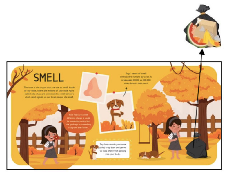
Figure 10. Sense of Smell Pages (Sergio, 2020)

afternoon by using yellowish orange and brown. These colors give a pleasant fragrance and fresh atmosphere. On this page, the reader is given an interactive activity by kissing a flower drawing that is held by this child character. It smells a nice, light and soft fragrance like we smell real flowers. Another activity is on the right page, where the character of a child is covering his nose because of an unpleasant odor, when the black plastic trash image is opened, an image of food waste is visible which causes an unpleasant smell (Figure 10).