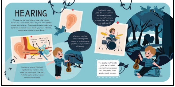
Figure 8. Sense of Hearing Pages, (Sergio, 2020)

The next part is the sense of hearing, namely the ears. Slightly different from the previous page, interactive activity is a button that must be pressed, and a sound is heard. The atmosphere built on this courtyard is that of life in the forest, where there are many voices that we rarely hear and realize in everyday life. Like the sound of the wind, rubbing leaves, animals, and so on. The forest atmosphere is calm, peaceful, dark because of the many large trees created from the blue, turquoise and green color families of various tones. Text is placed into groups so that it does not fill up one place only and gives a playful effect. The interactive activity on the left page uses a rotating technique to change the type of musical instrument the characters are holding (Figure 8).