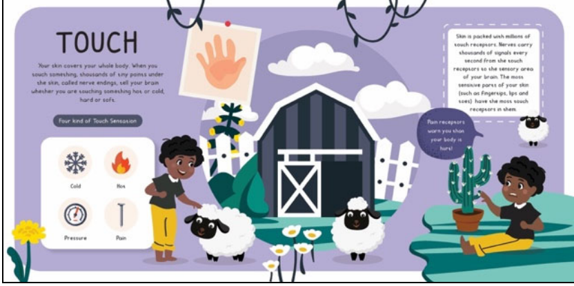
Figure 11. Sense of Touch Pages (Sergio, 2020)

The final senses discussed in this book are the touch (skin). The atmosphere you want to display is a farm, because in this unusual place there are many objects that we can touch with different sensations. For example, holding sheep's hair, thorns on a tree. Like an infographic, the text is divided according to the image. Information is given briefly and concisely. The interactive activity here is that the reader can touch the sheep and feel the soft sensation of the fleece as if we were touching a cotton ball. The color purple is used because of the sensitive color of human veins and a lot of it under the skin is generally described as purple or bluish. (Figure 11).