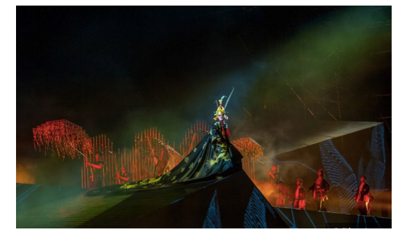
Figure 5. Costume of Oey Tambah Sia

Ariah's musical theatre open stage concept design is a theater stage with a geometric minimalist concept. The Ariah stage consists of 3 layers with almost symmetrical shapes with such tilt angles, carrying the concept of a minimalist stage design with geometrical shapes. It is called geometric because the shape of the stage consists of several geometric shapes like squares, triangles, as well as symmetrical and measurable. It happens because according to the opinion of Dave Robinson, that no one really knows what the label of postmodernism means, it might only be a nickname to refer to a set of attitudes, values, beliefs and feelings about what the actual meaning of life at the end of the 20th century. If such an opinion is adopted, that postmodernism is a condition of contemporary culture, then all cultural products that were born in the period after the end of the 20th century cannot be separated from those called postmodernism (Sugiharto, 2015; 203).