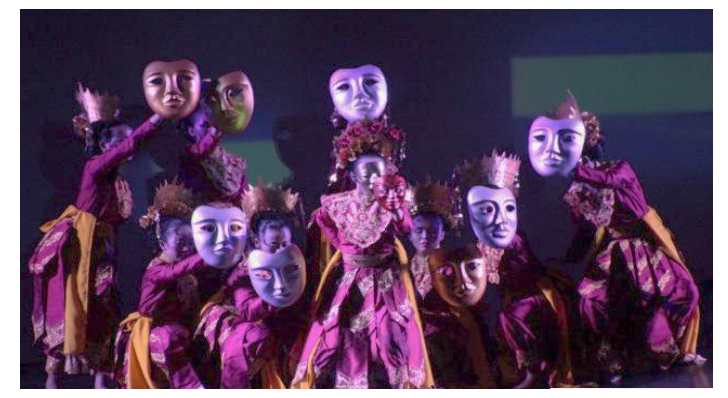
Figure 4. Topeng Dance in Ariah

Sometimes a person wears different kinds of masks in their life. Like the character played by the landlord. On one side wearing a helper mask and on the other side wearing a bad character mask. The Betawi mask has its own color and symbol, a white color called a banner, expressing the symbol of female's sensitivity, with gentle movements played by dancers. The pink mask is a symbol of a flirty woman. While the red mask becomes a symbol of arrogance and strength. In the past, Betawi masks were often played at a traditional party, and are believed to be able to reject reinforcements (Nurhidayat, 2018). Betawi mask dance had the influence of Sundanese and Chinese culture.