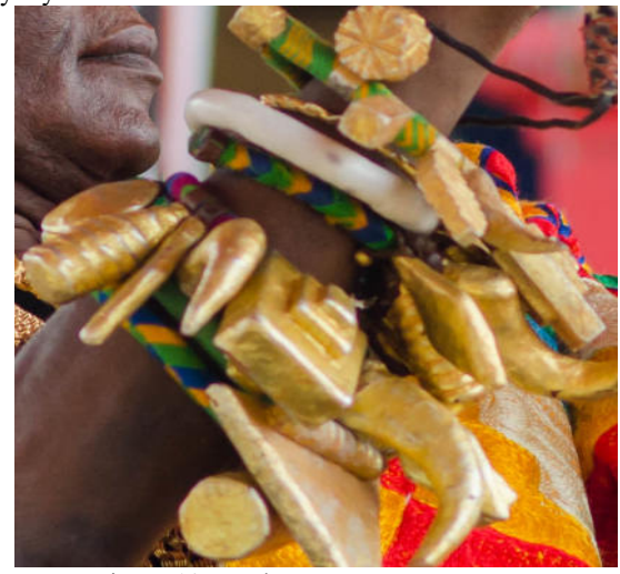
Figure 10 Hand ornament