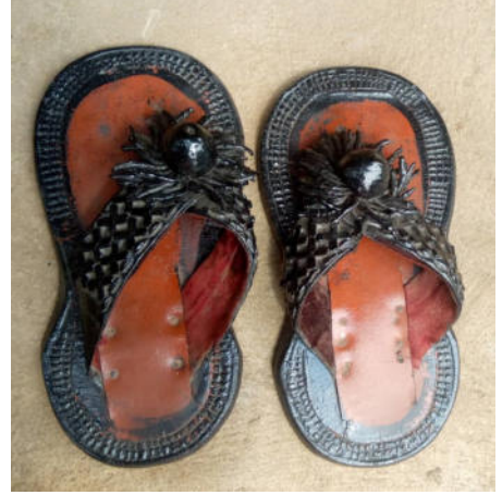
Fig 13 abodwese betoo aniton nwi