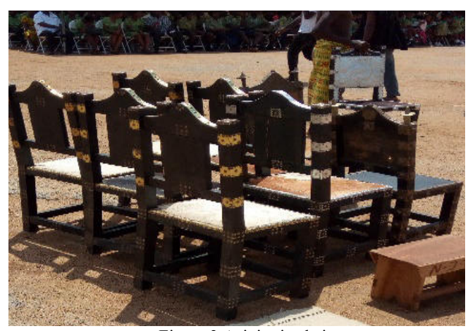
Figure.3 Asipimtia chairs