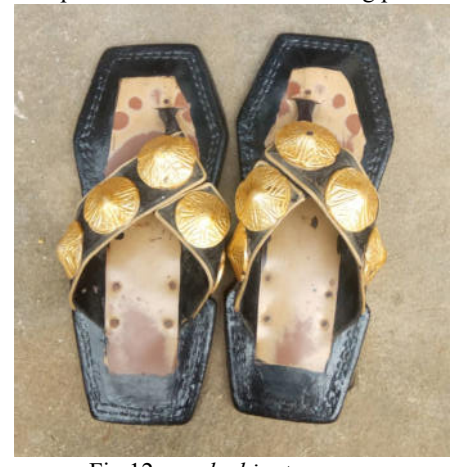
Fig 12 wo aka bi a twa so

Similarly, information gathered showed that the native sandal in Fig 13 was also made from worn out lorry tyre and leather like the one discussed in Fig 12. The top of this particular native sandal was made with black leather strap and the sole too is black. The leather strap on top has some designs like dot on it. Also, this sandal has a circular knob with several strips like hair on it and the designs make the sandal appears awful and horrific. The inner of the sandal is dark brown in colour. The design and the symbol on top of it conveys both visual and verbal messages which educated the public. The data gathered indicated that the name of the symbol on top of the sandal is known as "abodwese betoo aniton nwi" which literary means eye brow was in existence before the beard came. This proverb means that elders were there before chiefs were enstooled and for that matter the chiefs have to respect the elders in order to bring peace and amity in our societies.