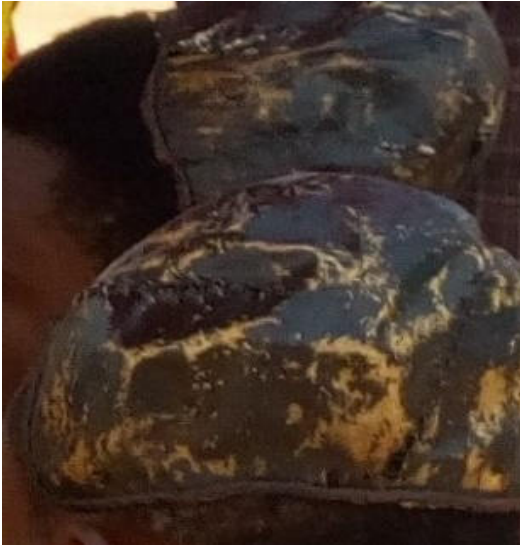
Figure.9 Skull cap ( kro bən kyɛ )

aesthetic value when it has principles and elements of art such as shape, colour, texture, harmony, balance and rhythm.