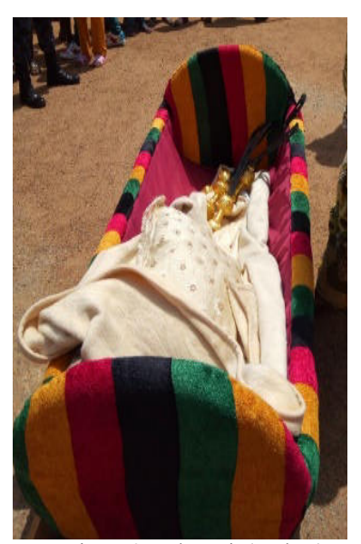
Figure.2: Palanquin(apakan)