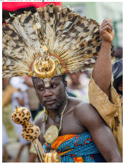
Figure 1b Sword bearer's hat( Ntakrakye ) Front view