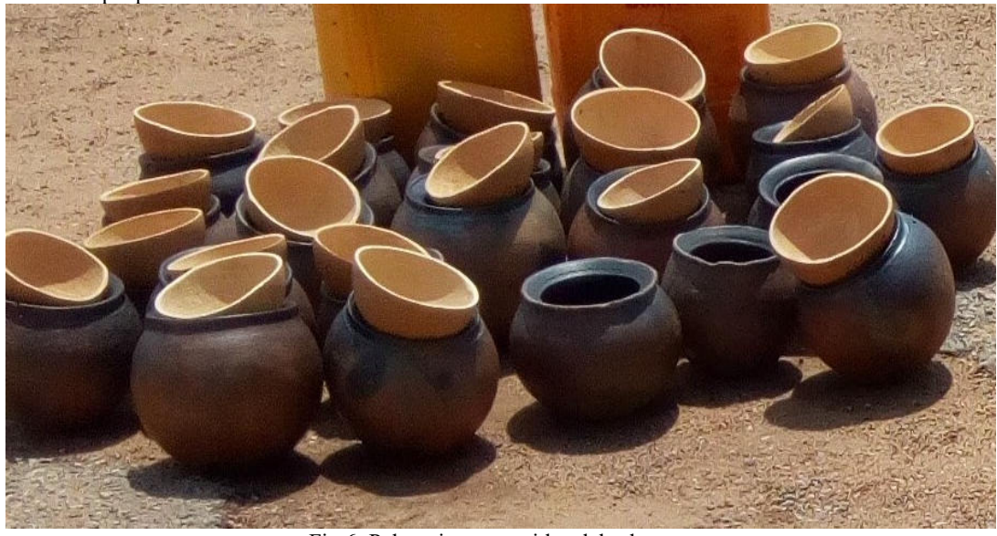
Fig.6: Palm wine pots with calabashes on top

It was observed that the colours of both the pots and the calabash contrasted very well, and therefore pleasing to the eye. The dark brown interspersed with black colour of the pots suggests reliability, comfort, friendship and warmth. The composition and arrangement endorse the ideas of Jacquette (2014) and Gyekye (1996) that aesthetic value is achieved when artefacts, events and scenes express emotions, gives pleasure and also sustains people's interest.