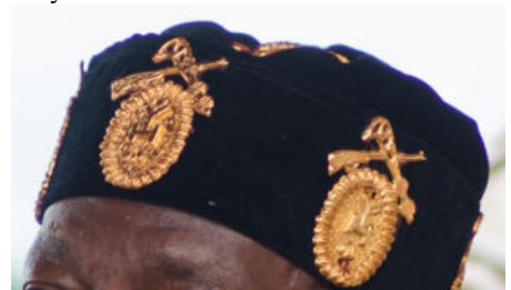
Figure.7: Black headgear with "Yiadom -Hwedie, Oko nti" symbols

headgears which distinguishes them from other participants and observers. Plate 4.7 portrays one of the headgears that were displayed during the festival celebrations. It was observed that the fabric which was used to produce this particular headgear is black velvet (agoo). The headgear is black in colour with golden symbols attached to it makes look elegant. The golden symbols affixed to the headgear is known as "Yiadom -Hwedie, Oko nti" symbol. Again, the "H" and "Y" shapes in the middle of the symbol gives the headgear splendid look. The circular symbol on which the sword and gun are attached to has some meandering design which is creatively crafted and makes the headgear outstanding. The design and textures used in the formation of the symbol make it very striking and enhances its aesthetic appearance. The blend of gold and black colours have made this headgear stand out. The black fabric used for the headgear symbolizes the pain and agony that the people passed through when coming to New Juaben, while the sword and gun also signifies the wars that they fought. In addition, it was discovered that the symbols indicate that the New Juaben state is strong, powerful and resilient and that the power and authority of chiefs should not be underrated. Besides, the symbol also signifies that there is unity among the people of the New Juaben state. The combination of the sword and gun are balanced on the circular symbol and it appeals to the eye.