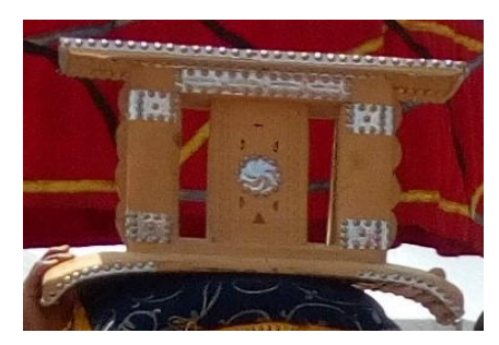
Figure 4 odehye nsu adwa