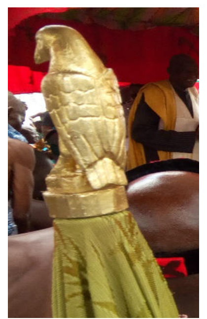
Figure 14:An umbrella finial