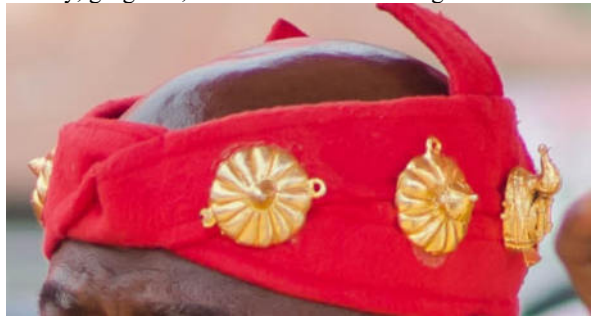
Figure.8: Me tena ho mma nfofoo nnane me kwayε headgear

The headgear in Figure.8 has good design qualities which makes it look very handsome, striking and alluring. The symbols on it is known as nfofoo which is derived from a plant that has a yellow flower. According to Nana Obugya Asante, this headgear is known as " me tena hɔ mma nfofoo nnane me kwaye " which literary means one should not sit unconcern for the unexpected to happen. The colour of this headgear is red and the fabric used for it is velvet. The design, shape and colour of the symbols affixed to the headgear are in conformity. The symbols and fluffy nature of the velvet used for the headgear make it look attractive and pleasant. The projections on top of the headgear look extraordinary, gorgeous, colourful and fascinating.