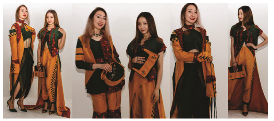
Figure 5. Images of dress fitness checking and photoshoot.

Imagination of a real looks from pictorial view is different from the final look on models' body or wearer body (Davis, 1996). Tuning in to silhouette in favor of details for a moment gives the designer, illustrator, or wearer precise control over the aesthetics of shape. After completing all the decorations in garments to give final look designer prepare the collection for checking the fittings and photoshoot to have a real experience about designs (Figure 5).