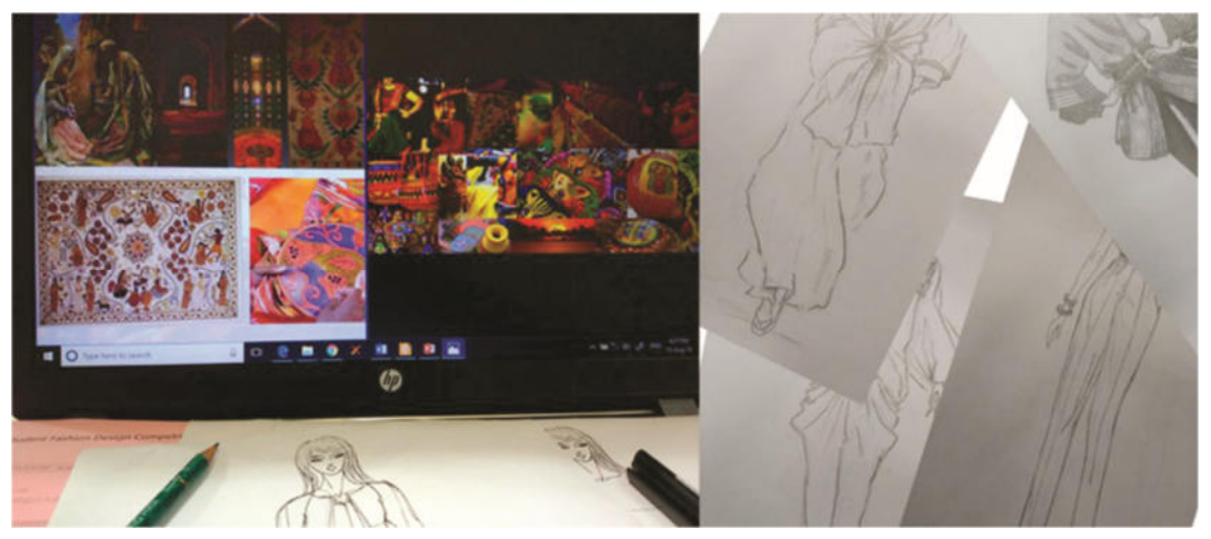
Figure 1. Images captured during design experiment and sample sketches drawn from inspiration.

Designer sketches more sample designs for the collection according to theme from the inspiration board and those illustrations have the influence of both cultural and modern cutline (Figure 1). During this design experiment some questions arises in designers to make clear about the inspiration are: a) Which elements can be used to modernized the design form cultural ethics? b) What is the relation between competition theme and designer's inspiration? c) How to change the sketching to keep theme concept? Finding the right balance between different shapes is an important factor, whether the designer wants the complete look to have a reserved silhouette or one with dramatic flair.