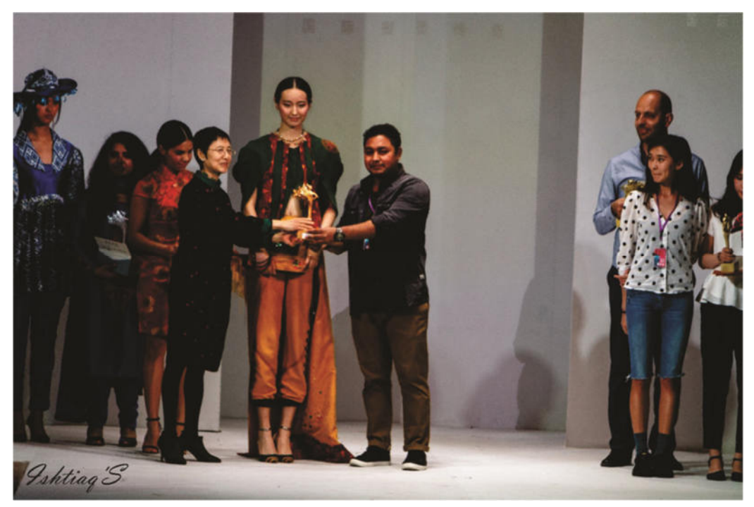
Figure 7. Image captured during award giving ceremony of "CUORI CUP- The 2nd International Student Fashion Design Competition" and author (in the middle with model) taking gold award as first price for this collection.

On April 26th, during 24th Shanghai Fashion week, the International student education management branch of Chinese higher education institute and 2018 fashion Shanghai Donghua University jointly organized "CUORI CUP" the second annual International student fashion design contest. Through the different stages of judgment before the final race, this design work "Fusion of Culture" became the first and won the "gold award prize" among the top 35 designers' work of 18 universities from 22 countries. This competition pays attention to the interaction and mutual learning of different cultures, and sets the stage for international students to display fashion design ideas. The theme of the competition is wide and creative, and it shows the fusion of "One Belt and One Road" aesthetic and multi-design culture.