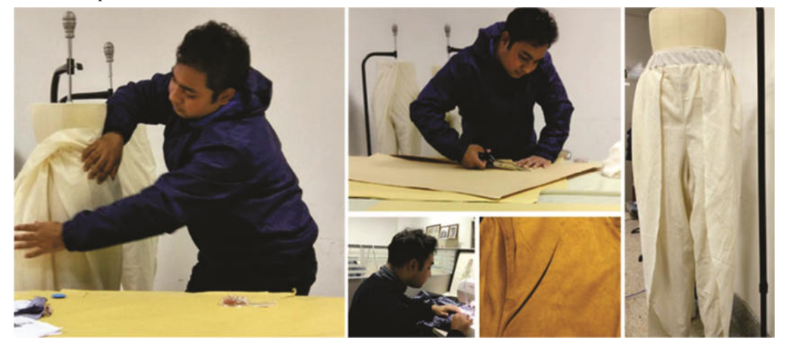
Figure 3. Images captured during step by step designer's (own) design developed process in studio.

Fashion is an appearance of sculpture. Amazingly, it works with a medium weight (fabric) that is basically twodimensional, to create three-dimensional silhouettes and shapes, whether on the garment's surface, in the shaping of its components, and/or in its overall appearance (Lurie, 1981). In the atelier, fabric is either cut flat by instinct, with flat patterns, or draped on a dress form or model to create the patterns for reproduction and there is no complete way or many approaches. Individual pattern pieces that come out of the creation process are a set of twodimensional shapes that, joined together, build the three-dimensional one. The basic fitted pattern shapes are called slopers: a basic sleeve, bodice, shift dress, princess-line dress, jacket, pant, and skirt pattern. From these basic fitted pieces, using a traditional dressmaker's approach, new pattern shapes can be created, controlling the actual shaping of each seam or panel, and thus, the shape of the finished garment. Pattern shapes can be combined to create new shapes.