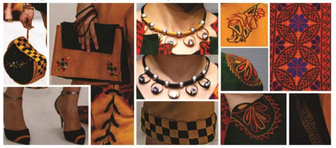
Figure 4. Images of collection's accessories, shoes, bags, ornaments, embroidery details.

A garment is cut, fit, and finished. Embellishment denotes a last step, a finishing touch, an extra, yet not without prior consideration. Since the beginning of history, decoration comes after the essential step of creating the base garment except where decorative adornments, and not garments, were the only form of body decoration. In fashion, a base garment may exist only for the purpose of carrying the ornament, or inversely an ornament is applied to a finished garment, calling attention to itself as it lures the eye, then settling into the overall look (Sproles & Burns, 1994). Embellishment is the punctuation mark of fashion design like the icing on the cake. Many embellishments walk a line between jewelry and garment. Jewelry can add interest or break up the symmetry of a garment and can be used interchangeably, depending on the mood or occasion, or even combine with different looks for different effects. Embellishments, however, carry a much higher level of commitment, staying with the garment, becoming an intrinsic part of the design, and so deserve careful consideration. The creativity in embellishment becomes the designer's choice and the wearer's agreement to carry. Prints, patterns, and textures are the more minute carriers of shapes, but when used this way, shape remains two-dimensional. On the other hand, embroidery, beads work, weaving techniques are remaining three-dimensional shapes.