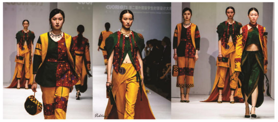
Figure 6. Picture captured during the fashion show of designer's collection in Shanghai.

Design competition and fashion show gives the opportunity to realize designer's works and it is the indicator of skill and repletion in design as well as value of concept. Pictures are taken from different angles and focuses on detailing of the costumes as a part of design competition requirements. After that designer prepared the collection for fashion show during the competition (Figure 6) and make the proper styling and makeups for the models.