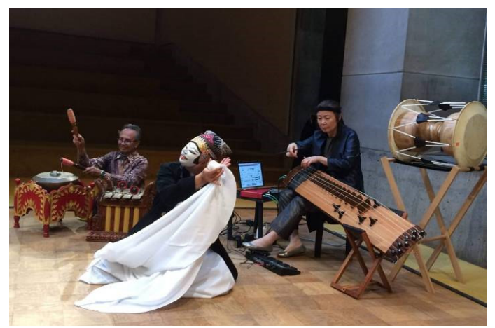
Gb. 5 Jengkeng Pose on the Development of Jawa Alus Dance