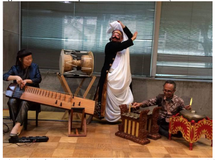
Gb. 6. Klana Figure, a depiction of greediness, Still Using Javanese Dance Gesture (Photo: S. Pamardi, 201