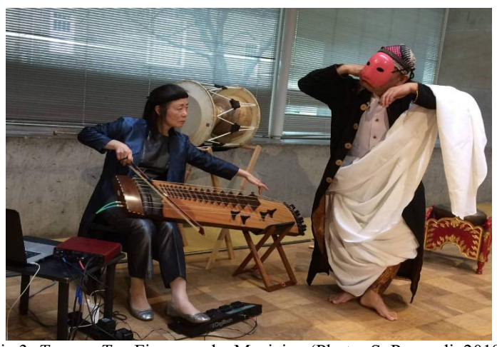
Pic.3. Topeng Tua Figure and a Musician