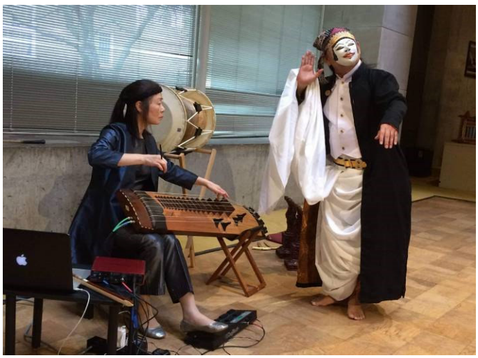
Gb.4. Topeng Muda (Topeng Panji) Depiction of a Knight's Ambition