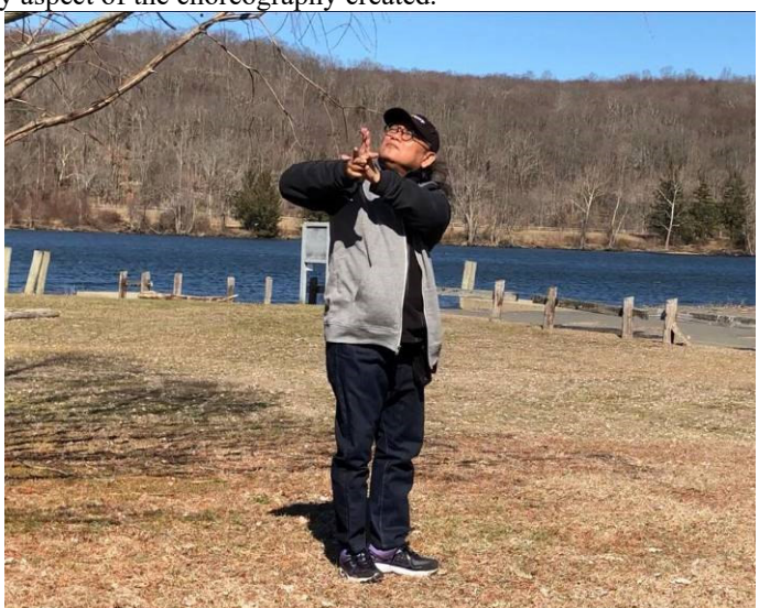
Pic. 1. Exploration in the Open to Look for Possible Motion

that was about to be staged. This training served to strengthen the dance created, in terms of motion, costume and makeup, dance music, and stage settings. Preparation for the performance was marked by a form of practice in an effort to harmonize every aspect of the choreography created.