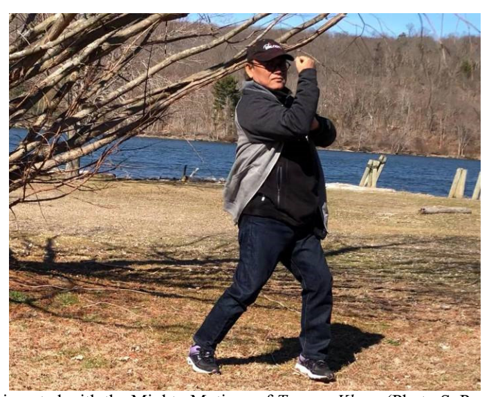
Pic.2 Experimented with the Mighty Motions of Topeng Klana