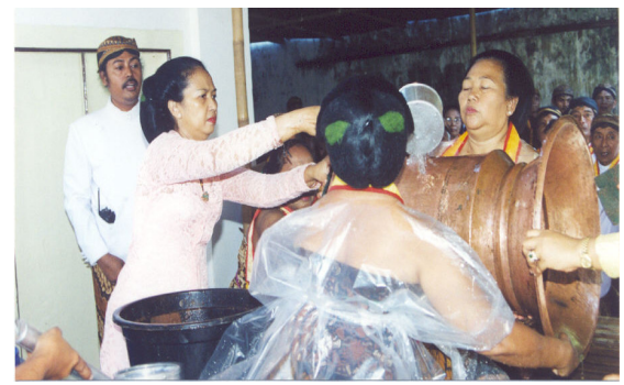
Picture 4: Dandang Kangjeng Kyai Dhudho di sirami (cleaned up) By GKR Alit assisted by abdi dalem, in Gondorasan.