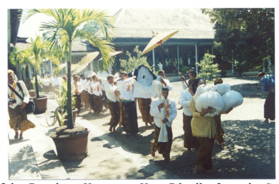
Picture 2: Kirab the exit of the Dandang Kangjeng Kyai Dhudho from the Storage Room to Gondorasan.