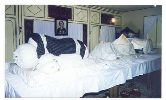
Picture 3: Dandang Kangjeng Kyai Dhudho di sareke (put to sleep/saved) in Gondorasan