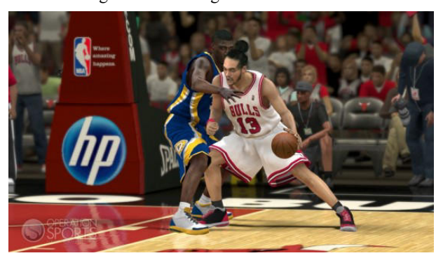
Figure 5. HP logo in 2K NBA.

Dynamic in-game advertising now takes part in the game mechanic more and more. Is this a good sign of a game? It might need more tests and time to prove, but it performs well in many games, such as Need for Speed and 2K Sports. The research about effective in-game advertising could be the latest innovation subject in recent years.