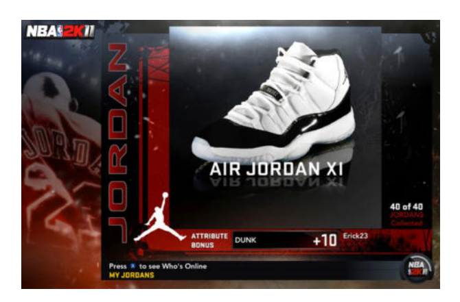
Figure 6. Nike Air Jordan shoes in 2K NBA.