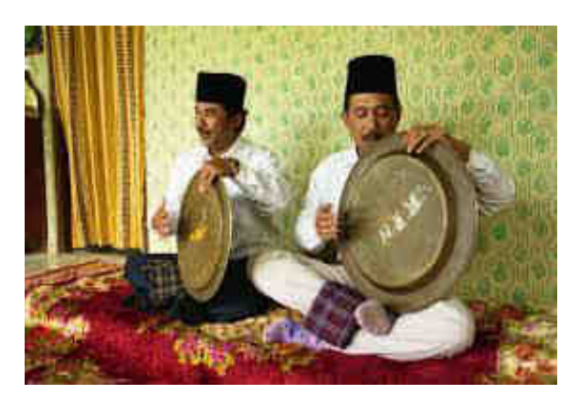
Picture 1. Performance of Salawaik Dulang (Photo: Documentation by Andar 2016)

The diagram above shows that a salawaik dulang performance begins with the imbauan kutbah and continues with the kutbah , yamolai , lagu cancang , closing, and prayer. The lagu cancang , with its popular rhythms such as the rhythms of Indian, Sundanese, and Javanese pop music, is enjoyed most by the young people. They find the varied rhythms exciting, even though they do not know the lyrics of the songs – songs such as Marajil Le Pakke. Aesthetically, it is more important for the young people to enjoy the rhythms of the music. The presence of different rhythms and new narration in a salawaik dulang performance creates new energy in an aesthetical manner (see the photo below).