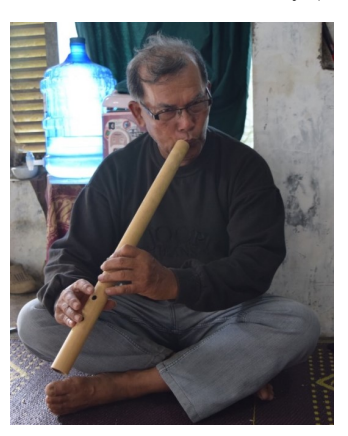
Picture 2. Position of lips for playing the saluang

The saluang is played by placing the end (known as the suai ) to the lips. The position of the lips against the suai is similar to the position of the mouth when whistling, and is known as manggalotoi . When the saluang is played, it is held at an angle, either to the right or the left, depending on individual preference or habit, with the end pointing downwards to the front of the body (see picture below).