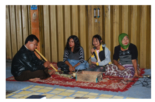
Picture 3. Bagurau in a saluang performance

Fourth, after the second cycle of the dendang melody, the saluang player immediately continues into the tutuik lagu or closing melody, a short melody which functions to end the performance of the dendang melody. The cadence of the tutuik lagu often switches to the tonic pitch of the saluang instrument to create a sense of closure to the dendang performance (see picture below).