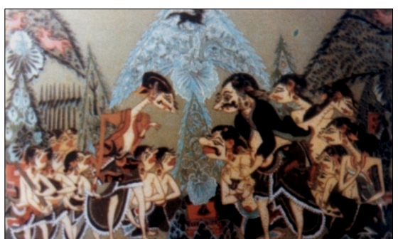
Figure 4: Sumadi (1993), Pertemuan Panji Asmarabangun dengan Para Pengawalnya (The Meeting of Panji Asmarabangun with His Guards): glass painting of wayang beber painted with revitalization concept.

The main basis of art of revitalization is traditional art. Thus, the strategy of its creation is conducted using concepts of conservation or conservation with mutrani ( nunggak semi ) (imitating the tradition based on the basic rules). However, the processing of the technique and the materials should be in accordance with the current needs.