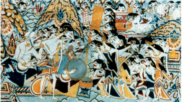
Figure 1. Wayang beber with Pacitan style with the scene of conversation at Karangtalun Market (Picture by Bagyo Suharyono), made as instructed by Mangkurat II.

Kartika (2012) mentions that news written by Ma Huan ( \pm 1414 M) set straight the existence of wayang beber in Majapahit, but the form of painting and stylization were not explained, and therefore, it is likely that the style was different from wayang beber heritage from Pacitan and Gunung Kidul (Groeneveldt in Kartika, 2012: 10). However, seen from the physical aspect, it can be simultaneously concluded that the characterizations in wayang beber (see Figure 1) must have been improved because Islam forbid the slight depiction of face, neck or whole body just like wayang purwa in general (Kartika, 2012: 10).