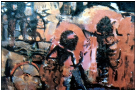
Figure 7. I Made Sudibia (1993), Dialog di Padang Kurusetra (A Dialogue in Kurusetra Field) , oil paint on a canvas, size 110 X 90cm.

On the Figure 6 we can see the story of Ramayana in the scene of The Meeting of Shinta and Hanoman . This scene tells that when Shinta was kidnapped by Rahwana , Rama asked Hanoman to bring Shinta back. The painting is designed in expressive manners with figurative composition reflected from such figures as Hanoman , Dewi Shinta and Trijata . The style of the painting is Balinese contemporer painting style. The painting is a form of painting art reinterpretation as the realization of the artist's engineering in delivering his ideas. The composition is arranged as a whole as if it reminds us to the form of pakeliran in wayang kuit purwa . The typical characteristic of artworks with concepts of reinterpretation is transformation of inspiration to aspiration (Kartika, 2012:110).