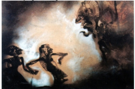
Figure 6: Wayan Suartha (1993), Hanoman Duta , oil paint on a canvas, size 95 X 75 cm.

The works of symbolic reinterpretation are developed with a concept revealing private concept seeing life through humans' behaviors. The behaviors are mostly reflected from the figures or the stories in wayang . It creates assumption that wayang has a very deep dimension reflecting attitudes and behaviors in life. Through paintings, the artists ask the viewers to reflect their life through their works. In other words, it is assumed that their works belong to subjective impression painted with one thematic scene in a story, instead of works reflecting scene as a means of conveying meaning (Kartika, 2012:79).