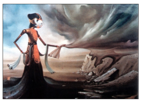
Figure 9: Ivan Hariyanto (1993), Mengibas Awan (Flicking the Cloud) oil paint on a canvas, size 90X70 cm.

The art of painting with symbolic abstraction is conceptually a form of modern painting arts making use of wayang figure as the basic element of its composition. The use of wayang has contextually experienced reduction as the artist interprets the form of wayang symbolically. The appearance of wayang figures is no longer as thematically idea realization but as textual symbol presented by the artist in order to provide free interpretation for the viewers.