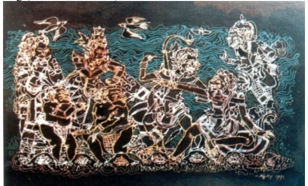
Figure 5: Abay D. Subarna (1993), Fragment 1, oil paint on a canvas.

Traditional idioms as the results of reinterpretation present as a combination structure with modern technique of elaboration. Therefore, there will be variation in style depending on the reduction done by the artists. Although the works portray manipulation of certain story, the story idea is merely a result of stimulation in revealing the artist's feeling (Kartika, 2016:90).