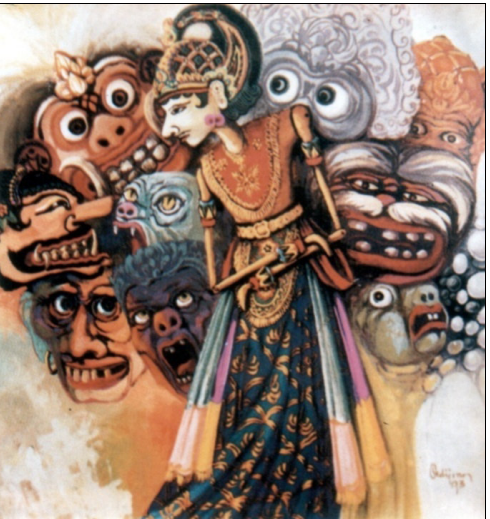
Figure 8. Oedijono (1993), Cobaan, acrylic on a canvass, size 100 X 100 cm, (Repro photo by Kartika, 1998).

Traditional idioms portrayed do not only represent particular idioms, but also serve as a form of life symbolism. Semar and Arjuna , for example, are not only main figures, but idioms reflecting the artist's ideas through the symbolism in life. The artist tries to express the idea through idioms as one of symbols conveyed to viewers.