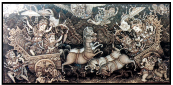
Figure 2. I Gusti Ketut Kobot, the Battle at Kuru Setra, (141 x 70 cm), Tempera on Canvas,

Painting Art of Modern Balinesse Puppet with Pita Maha Style(Picture by Kartika, 1998)