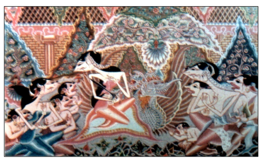
Figure 3: Karmin (1993), Dewi Sekartaji sayembara, a glass painting of wayang beber

The works created by the artists are study-tradition works attempted to find alternatives for conservation by representing or imitating cultural heritage. The works of sanggit are regarded forms of reproduction with innovation since the artists employ reproduction technique by imitating and adjusting the volumes with innovation or by imitating some models, while the volumes are selected from jagong (acts) which are then arranged based on story ideas.