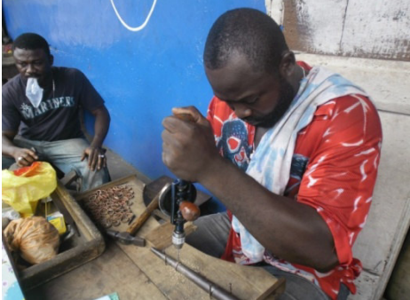
Fig. 1: A goldsmith working on brass rings

The rising cost of precious metals lately is impacting on jewellery production in Ghana. All respondents interviewed agree that the current prices of precious metals such as gold (Au) and silver (Ag) negatively affect the costing of jewellery production. Ten (10) of the respondents, representing fifty percent (50%) explained that the high cost of gold and silver do make customers feel cheated when the price of finished jewellery is mentioned to them. The customers were now resorting to ordering low carat gold jewellery such as nine (9) carat gold articles and sometimes they even ordered for brass jewellery articles as substitutes for gold wares. Figure 1 shows goldsmiths working on brass instead of gold.