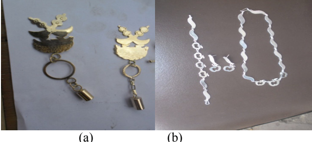
Fig. 2a & 2b: Pierced jewellery works

interviewed were of the view that they handled both small and large orders depending on the nature of the works that a client commissioned them to do. The works they produced were mainly done by using piercing and fabrication methods. However, they sometimes employed casting method as well. Ten percent (10%) of the respondents were of the view that they usually assessed the method which was suitable and used it to execute orders. Figures 2a and 2b show pierced jewellery works at a jeweller's shop.