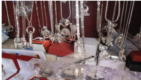
Fig. 6: Showcased jewellery pieces at a shop

and piercing are the main methods used by goldsmiths for producing jewellery works, then it becomes obvious that dies and punches are not often used. They, however, admitted that they used punches and doming blocks for making works which involve the making of 'balls' and 'half balls' which are used for pendants, earrings and chains. Also, it could be said that if doming block and punches used by the goldsmiths are all imported as observed, then it could be established that it demonstrated limited creative abilities of the goldsmiths as it showed they were unable to use their own ideas to create dies to emboss jewellery elements for their jewellery production. They merely rely solely on already made ideas in the form of doming blocks and punches to create some of their jewellery.