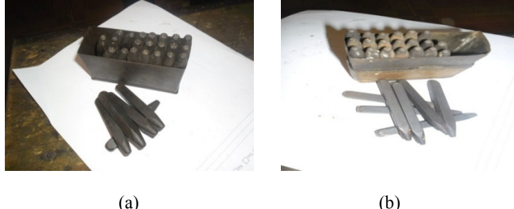
Fig. 4a & 4b: Letter Punches used by the Goldsmiths