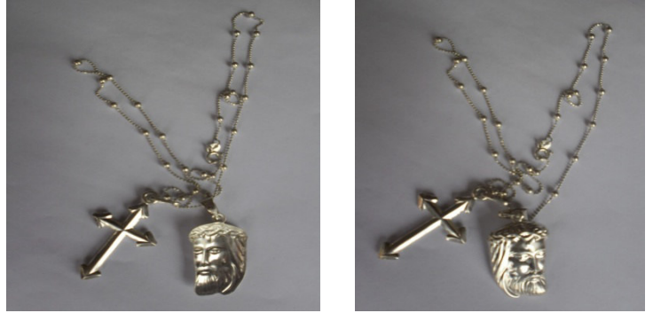
(a) back part (b) front part Fig. 5a &5b back and front parts of imported embossed elements in silver Table 2: Number of Years the Respondents have been in the Jewellery Business

visited but the goldsmiths admitted that they were imported and used as elements for jewellery sets. Figure 5a &5b show the back and front parts of imported embossed elements