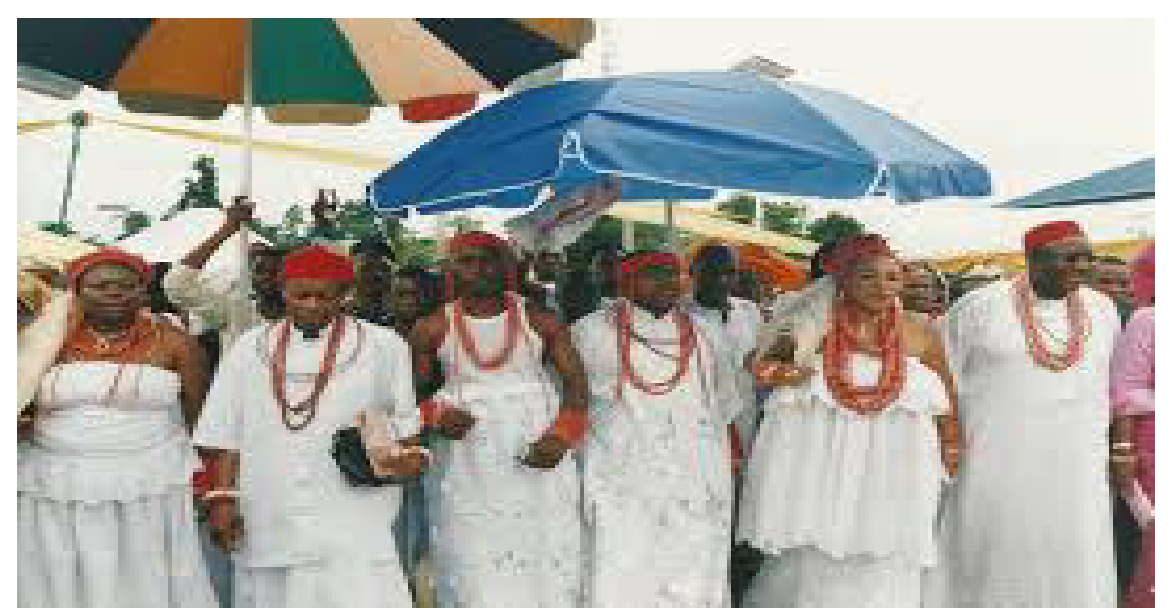
THE ELDERS IN EGBA FESTIVAL (PLATE 4