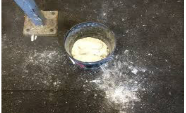
ORHE IN PREPARATION (PLATE 6)