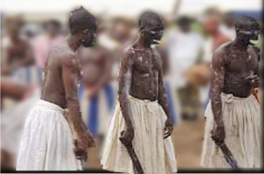
WRESTLERS ALL READY (PLATE 8)