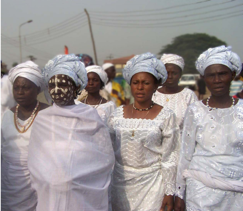
THE PRIESTESS IN ONE OF THE COMMUNITIES IN KOKORI DESIGNED WITH ORHE AND SOME MEMBERS OF THE COMMUNITY. (PLATE 7)