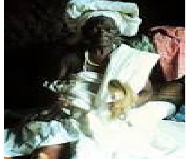
THE PRIESTESS OF EGBA ( PLATE 2)