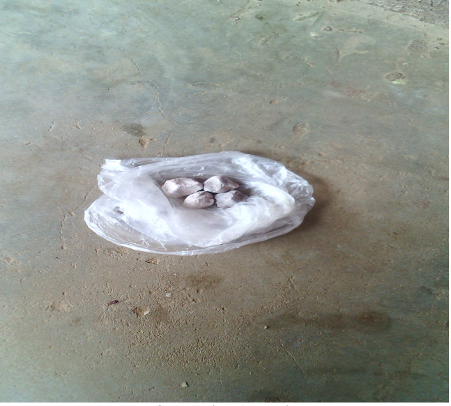
ORHE (PLATE 5)

In core Igbo land, "Orhe" known as Nzu is used in different ways and especially for the women who just delivered a baby, to provide freshness for both the mother and the baby, and also a radiant skin free from skin infection. In Egba Festival, designs on the body are just done with the Orhe. Orhe as seen in Plate 5.