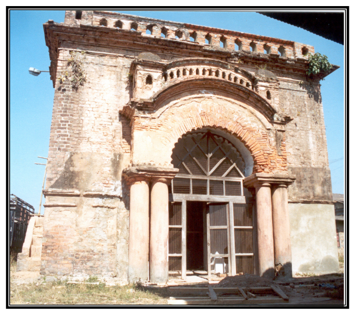
Fig. 1 Front View