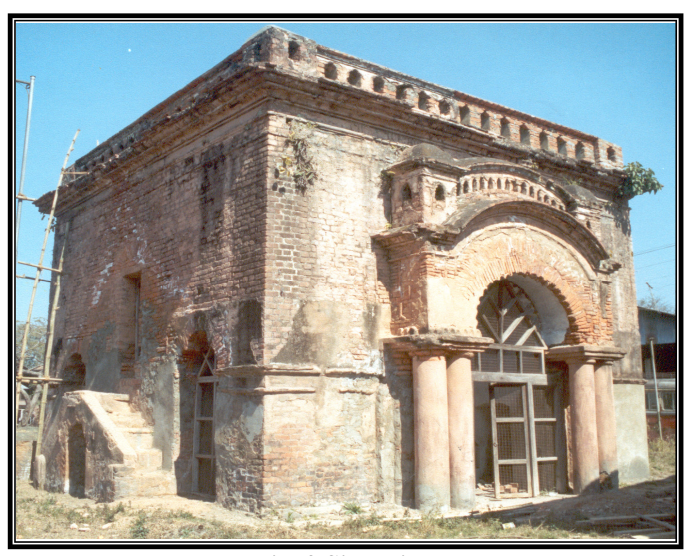
Fig. 2 Side View