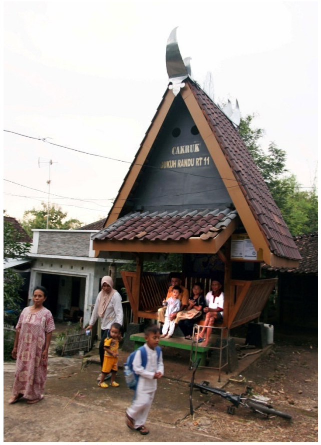
Figure 4: Embodiment cakruk design.

Referring to the picture above the atmosphere in or around cakruk is far from being rigid, austere, as a reflection of the characteristic of a security guarding post. There are absolutely no safeguards activities by the guards but instead there are children who are playing, mothers who are caring for children and other parents who are sitting in a relax atmosphere while chatting.