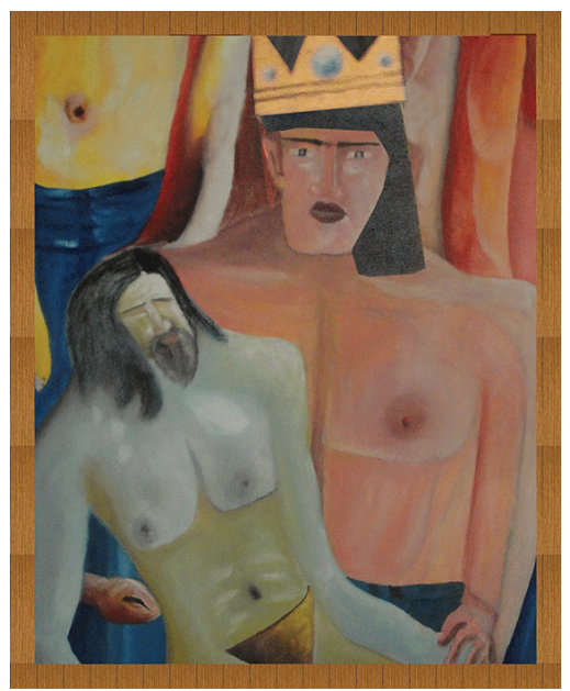
Pattern (2) It also symbolizes the fight between good and evil.