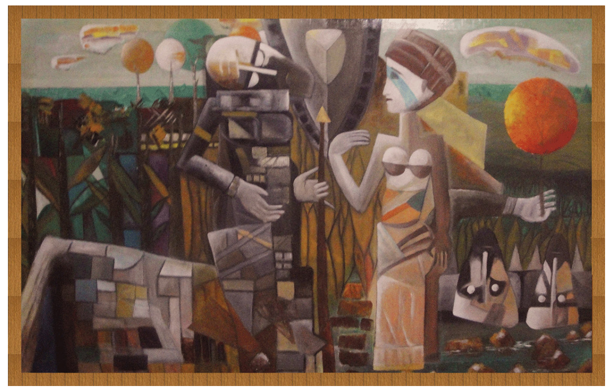
Pattern (5) Cedar Forest and the blessing of the Gods, a sleep following the harvest leading to total loss.