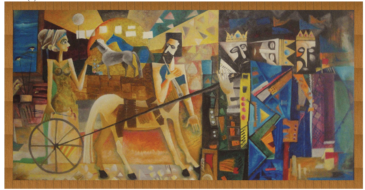
Pattern (8) the continued struggle within Gilgamesh's imagination between immortality and inevitable death.

Enkidu's death made Gilgamesh, his friend, sink in sorrow and loneliness. Gilgamesh dipped into sad thoughts about how could man get rid of death and become immortal. If man knew how, similar to the gods, his friend Enkidu would have not died and he would not have feared the awaited death. And for all that Gilgamesh embarked on a journey full of risks and dangers. He was after the plant of 'life' at the bottom of the oceans Pattern (9).