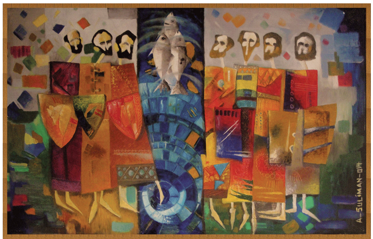
Pattern (3) wars were part of daily life protecting the existence and expansion of the Sumerian kingdom

So he presented the matter in front of the congress reminding them of the need not to surrender to the demands of the king of 'Kesh' as well as for the need for resistance and carrying of arms. But the senates turned his request down and preferred to surrender rather than taking up arms. Gilgamesh turned then to the members of the 'city council' consisting of the city fighters and their response was direct and clear: