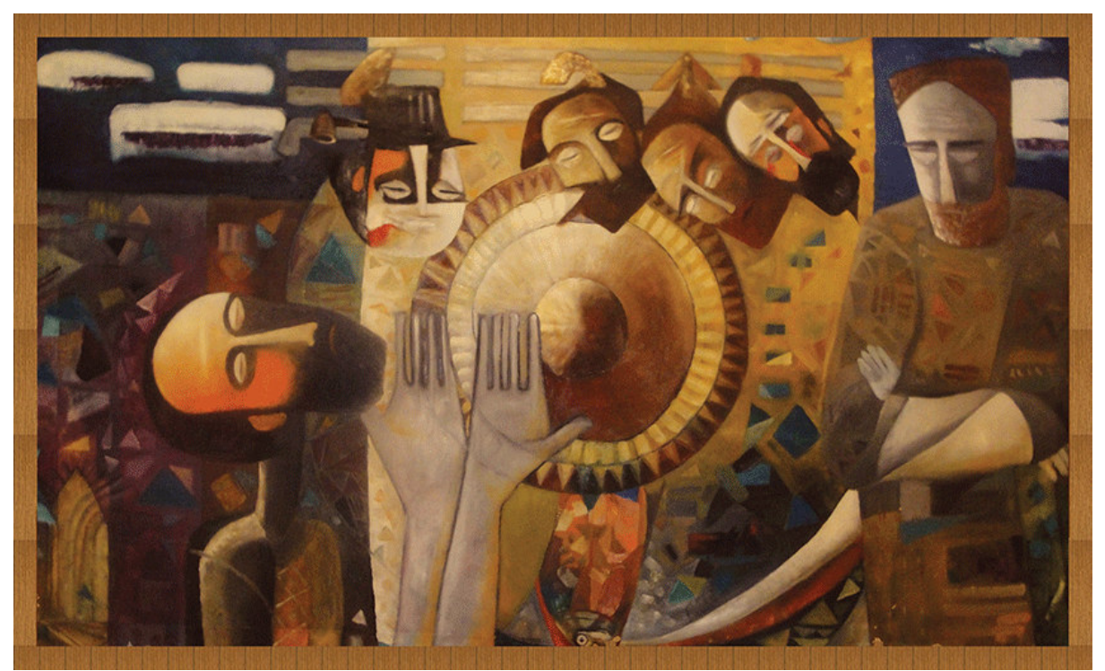
Pattern (6) Gilgamesh's heroic acts leading to victory.