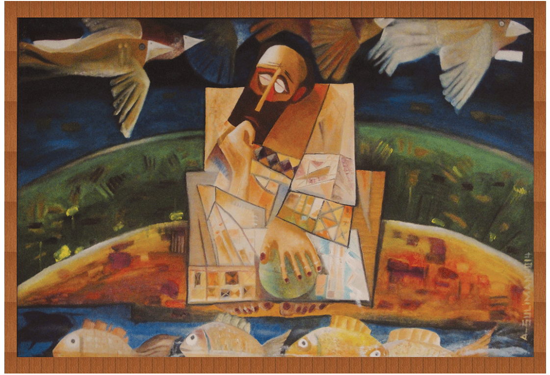
Pattern (9) Gilgamesh dwells in thought and is lost amongst sorrow, sadness and loneliness following the death of Enkidu.